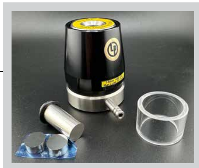
KBr Slide Holder

0016-009 Evacuable 13mm KBr Die 6111 13mm Magnetic KBr Slide Holder