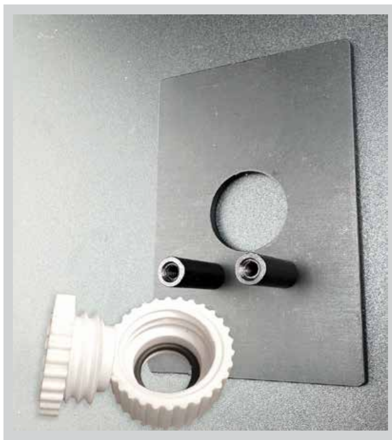
Mini Cell Kit