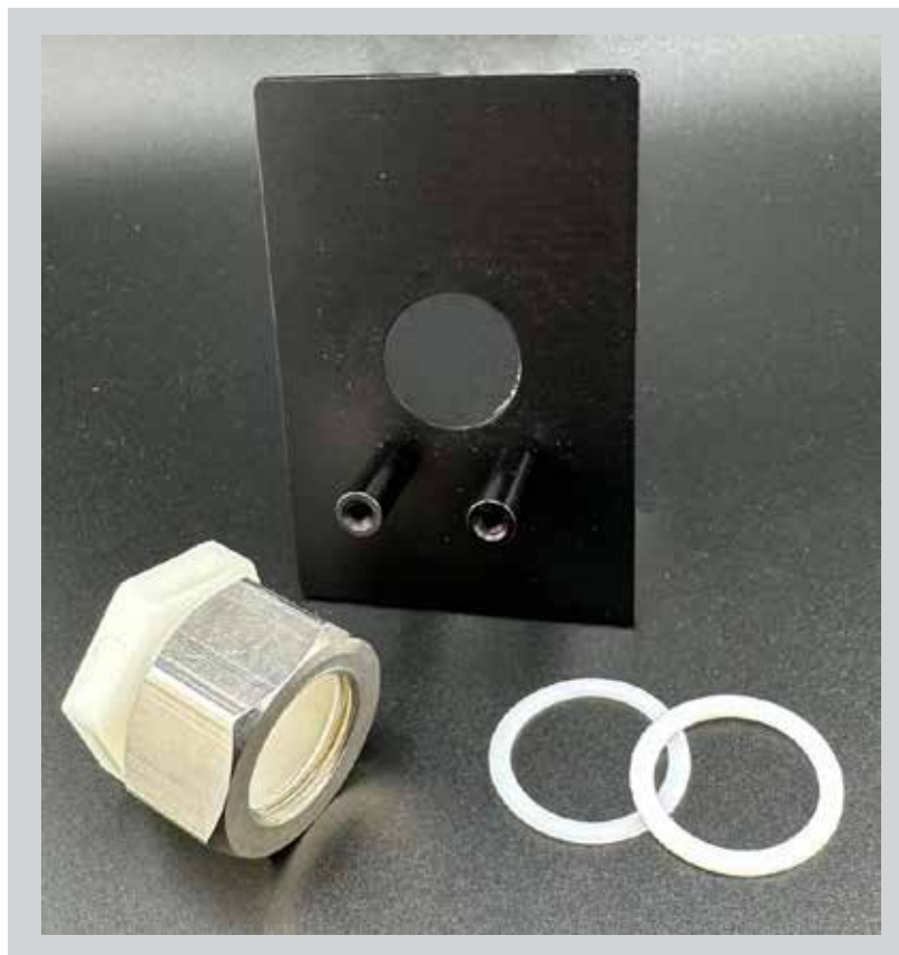
Beta Cell Kit

The Beta Cell is the most convenient, low-cost, easiest to use Demountable Cell available. Assembly is accomplished by placing the sample between two undrilled windows that are separated by a spacer. The windows are then placed into the holder and held secure with the threaded retaining ring. This type of cell is ideal for student use and is durable enough for continuous use. Recommended when analyzing unknown samples so as not to risk ruining more expensive cells. Uses standard 25 x 4mm discs.