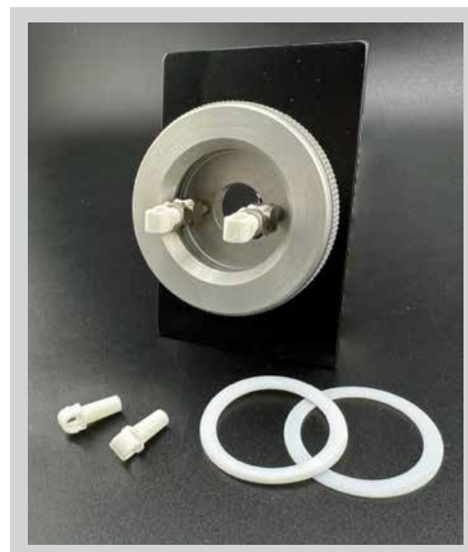
Cell Holder Kit