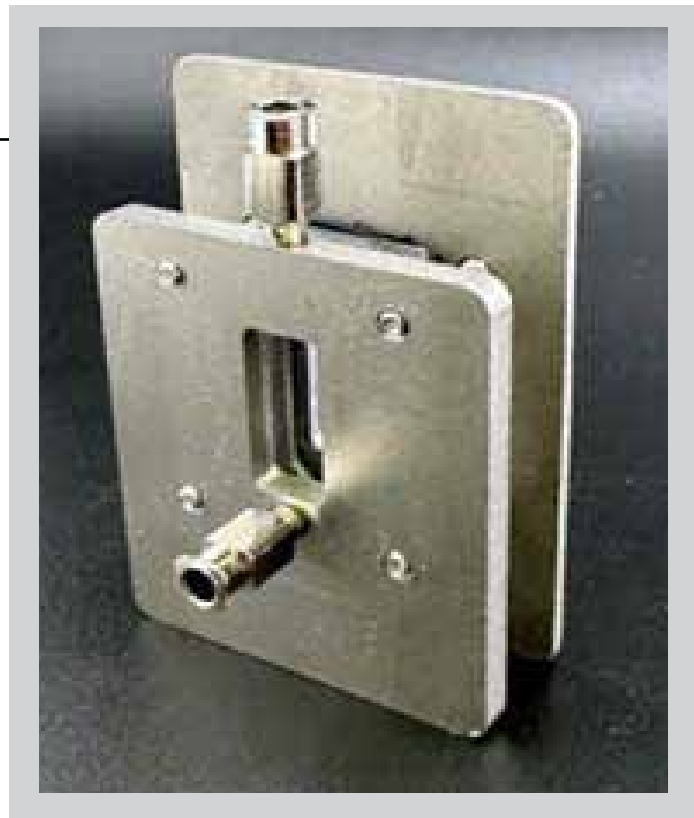
Sealed Liquid Cells