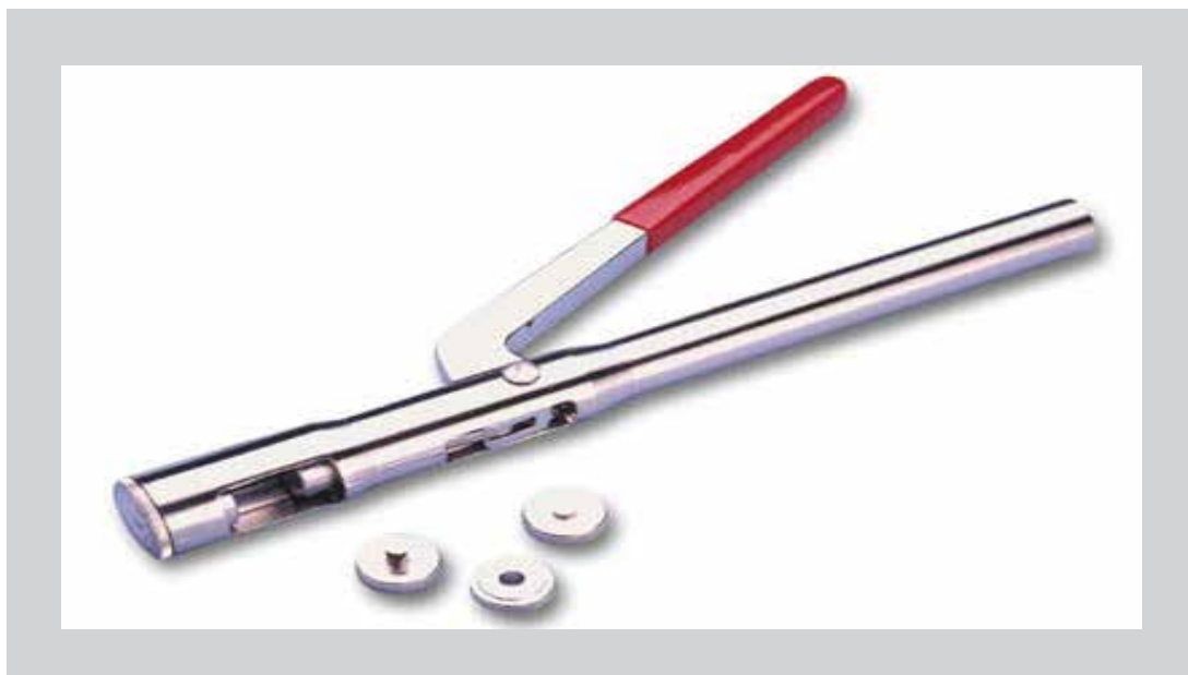
Quick Press Set