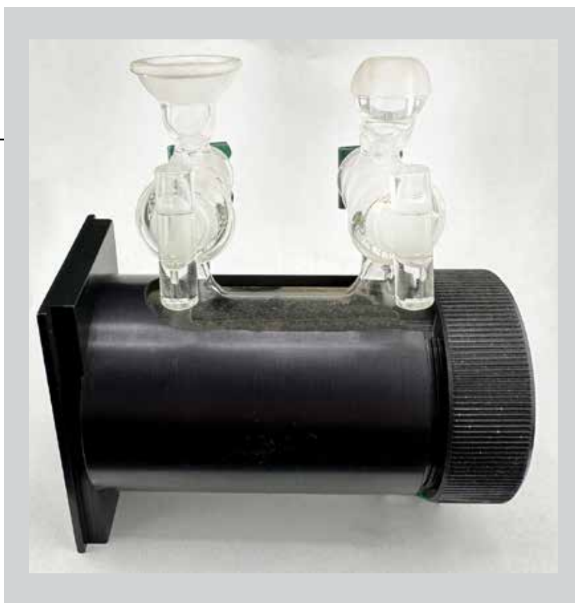
Demountable Gas Cell