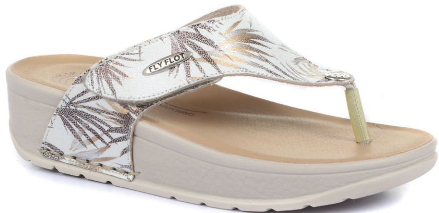
Fly Flot Palm Print Wedge Flip Flops £46.99 £31.99