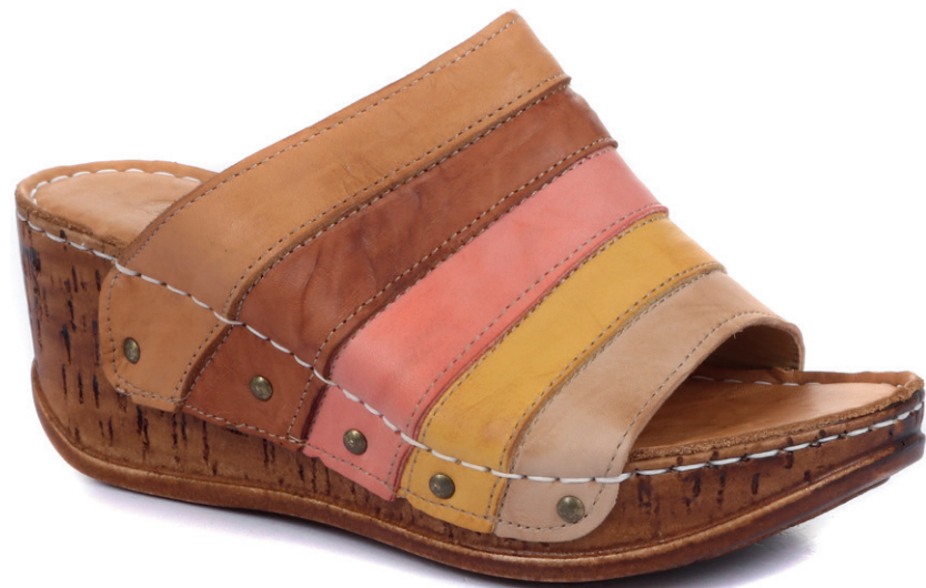
Leather Wedge Mule £59.99 £39.99