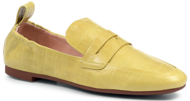
Leather Croc-Effect Penny Loafer £85.00 £45.00