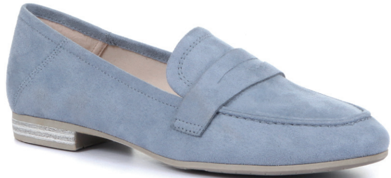
Ladies Penny Loafers £44.99 £29.99