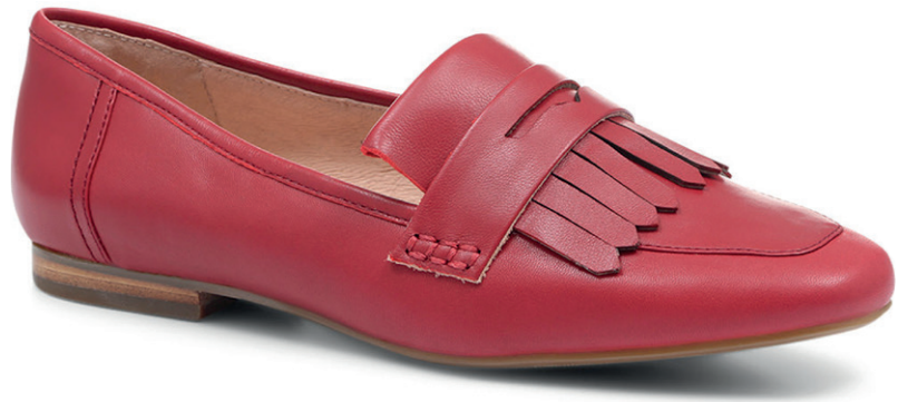
Flat Leather Penny Loafer £79.00 £55.00