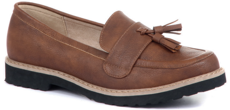
Ladies Loafer £44.99 £29.99