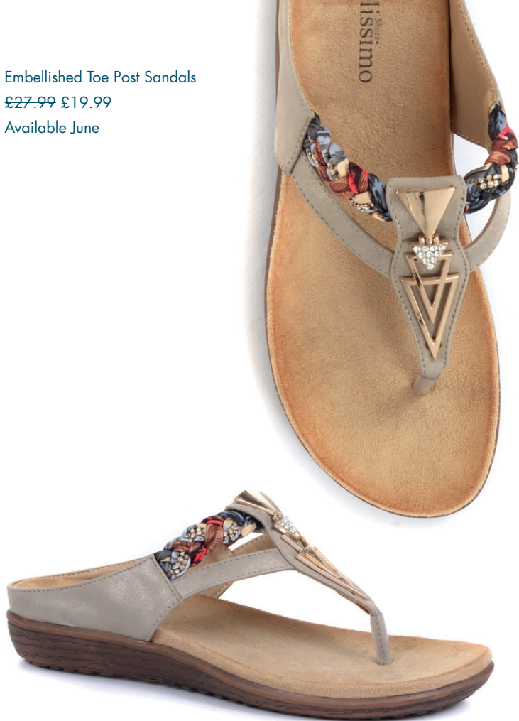
Embellished Toe Post Sandals £27.99 £19.99 Available June