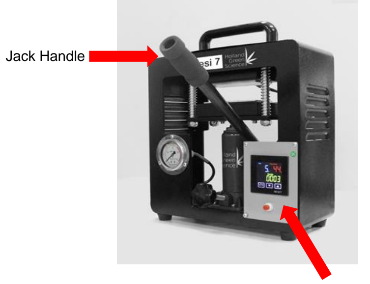
Timer and Thermostat