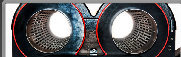
DUAL TUMBLER TECHNOLOGY