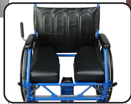
B: Drop seat lowered for transfer-free toileting.