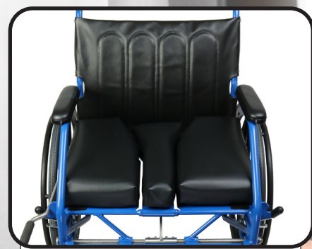
A: Drop seat in the up position for all-day use.