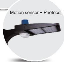
Motion sensor + Photocell