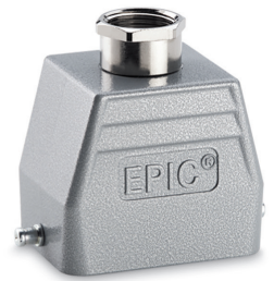
All dimensions are in mm.