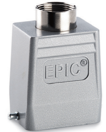
All dimensions are in mm.