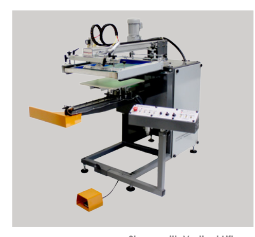
Shown with Vertical Lift, Shuttle Table, and AC Print Head