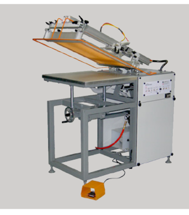
Shown with Quick-Height Adjustable Vacuum Table for Graphic Printing