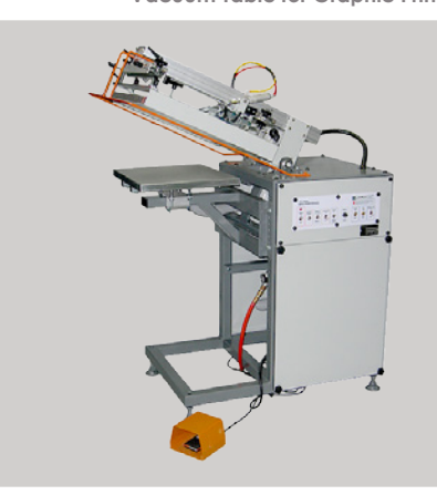
Shown with Optional Vacuum Table