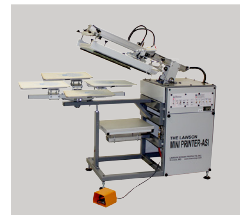
Shown with 4-Station Manual Carousel (2-Station Carousel Available)