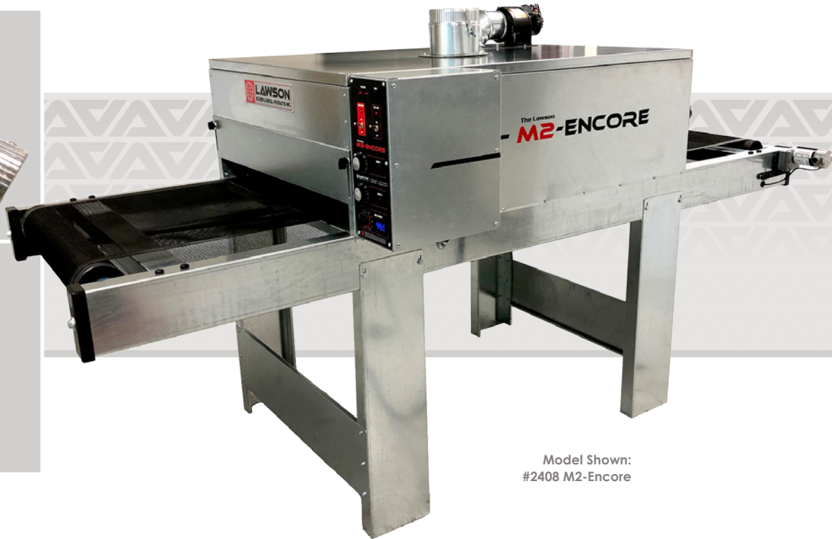
Model Shown: #2408 M2-Encore