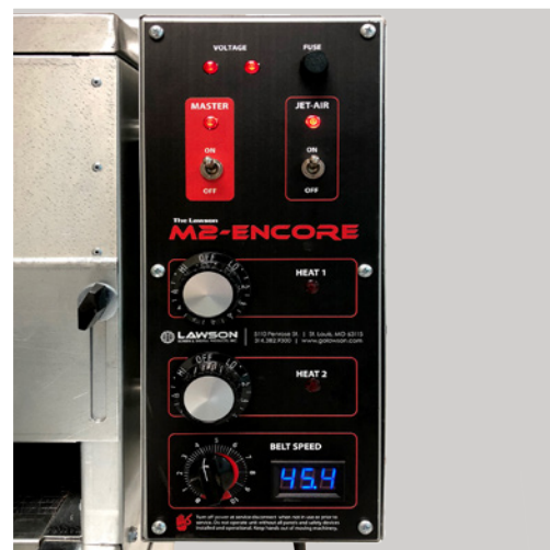
Adjustable Control Panel