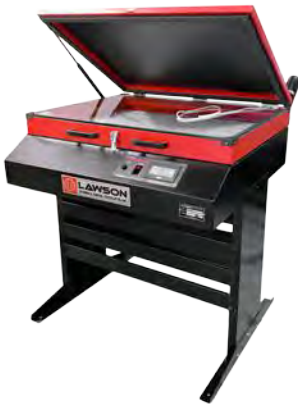
Model #2431 (Shown with optional floor legs)

Ideal for exposing standard manual or automatic size textile frames up to 24" x 31".