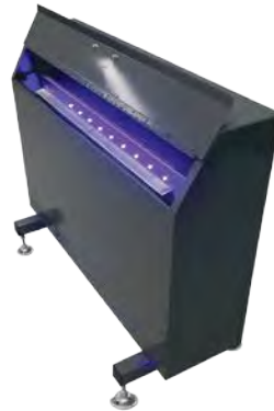
Vertical CTS #2431

Great for graphic presses, poster printers or jumbo textile size frames. Use frames up to 48" x 72". Floor legs standard. Casters optional.