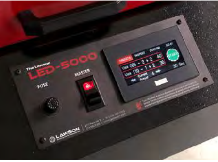
HMI Touchscreen Control Panel