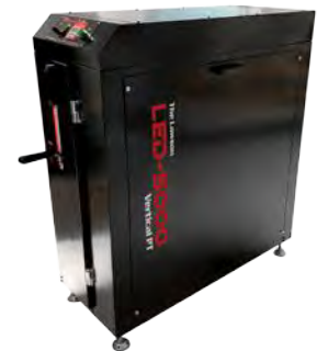
CTS Vertical Slide #2536

Great for CTS imaged screens. No Glass, "drop-in" style loading, digital controls and exposure indicator. Use both manual and automatic size frames, up to 24" x 31".