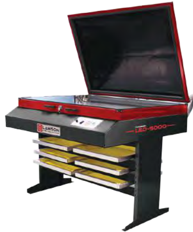
Model #3248 (Shown with optional floor legs)

Ideal for exposing standard manual or automatic size textile frames up to 24" x 31".