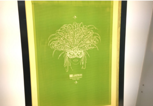
Print Ready Screens