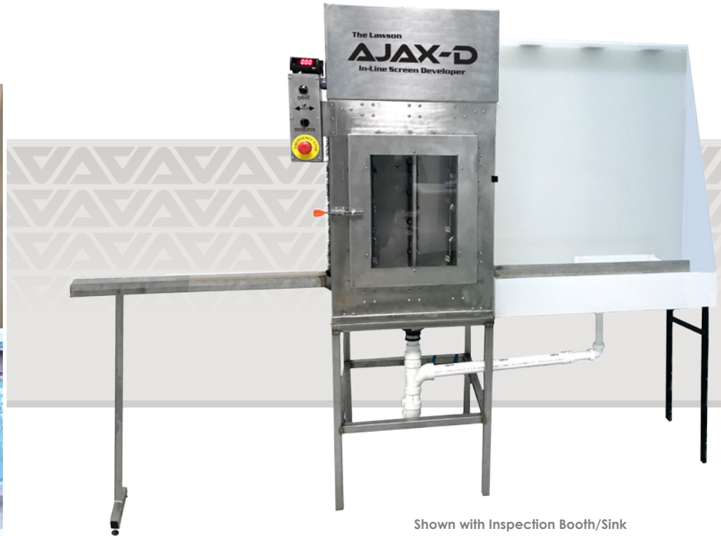
Shown with Inspection Booth/Sink