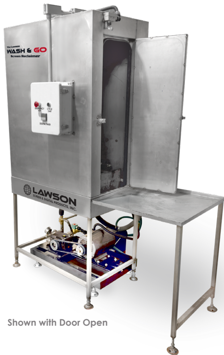
Shown with Door Open