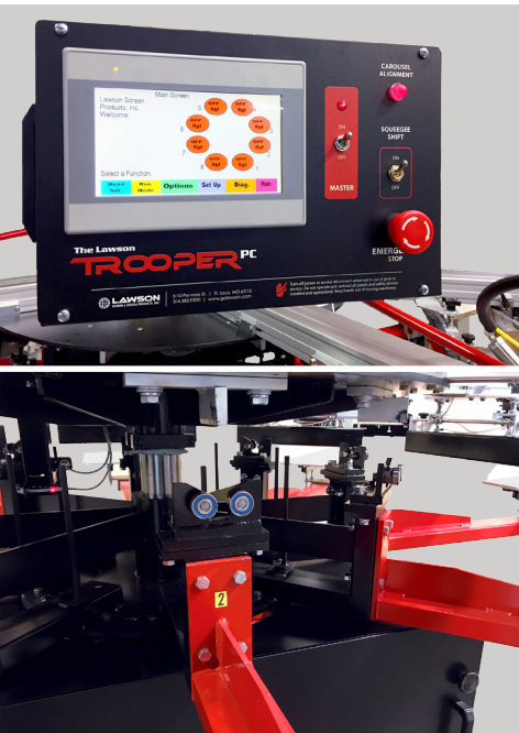
Registration Lock w/ Ball Bearings