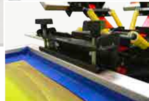
Frame Clamping Bar