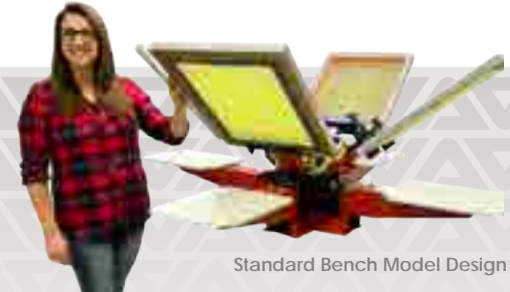
Standard Bench Model Design