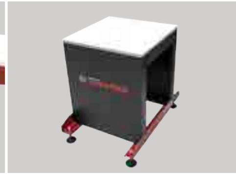
Optional Floor Stand