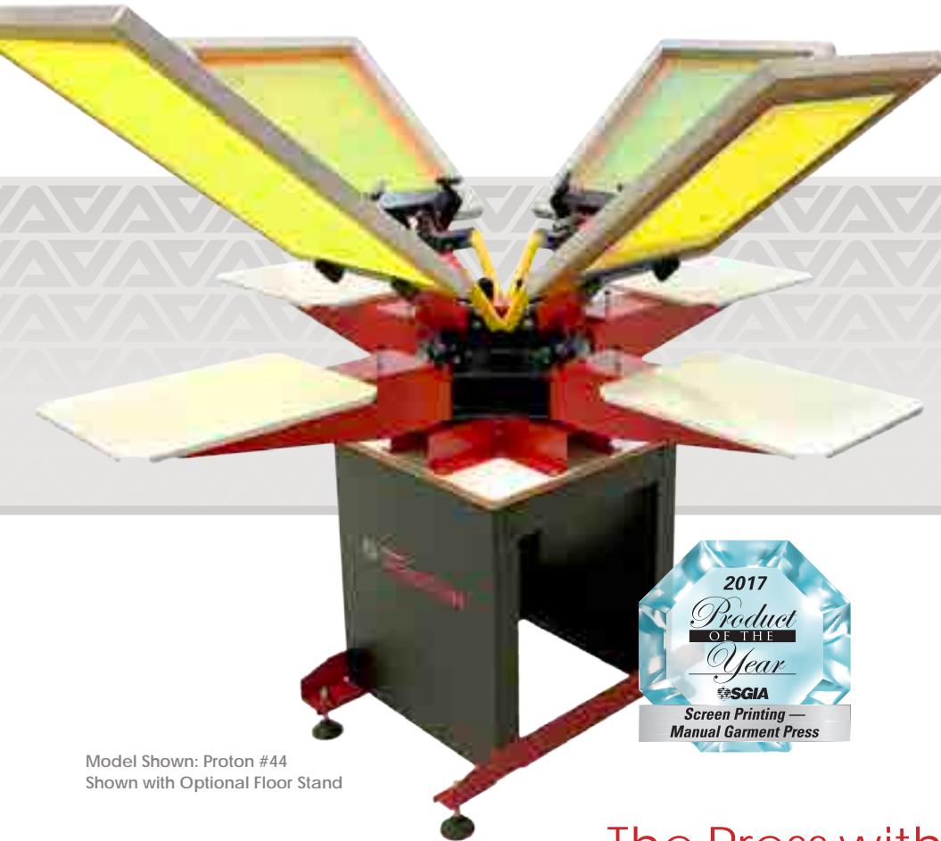
Model Shown: Proton #44 Shown with Optional Floor Stand