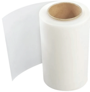
DTF Film Roll

This DTF equipment package is great for those looking to add DTF printing or to start a small DTF printing operation. This DTF equipment start up package comes with the R2 DTF printer, automatic A11 DTF powder applicator/dryer and purifier . This set-up is great for those with a small space or those wanting to print out of their home, basement or garage set-up as it only requires 120 volts.