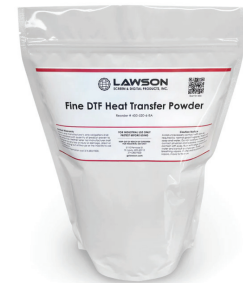
Fine DTF Transfer Powder