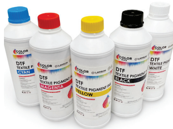
Color Max Ink