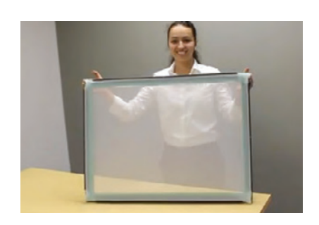
The Lawson Panel Frame has made screen stretching fun again. Simply snap the locking strip into the frame and tension to completion in less than 1 minute! Minimal operator training required.