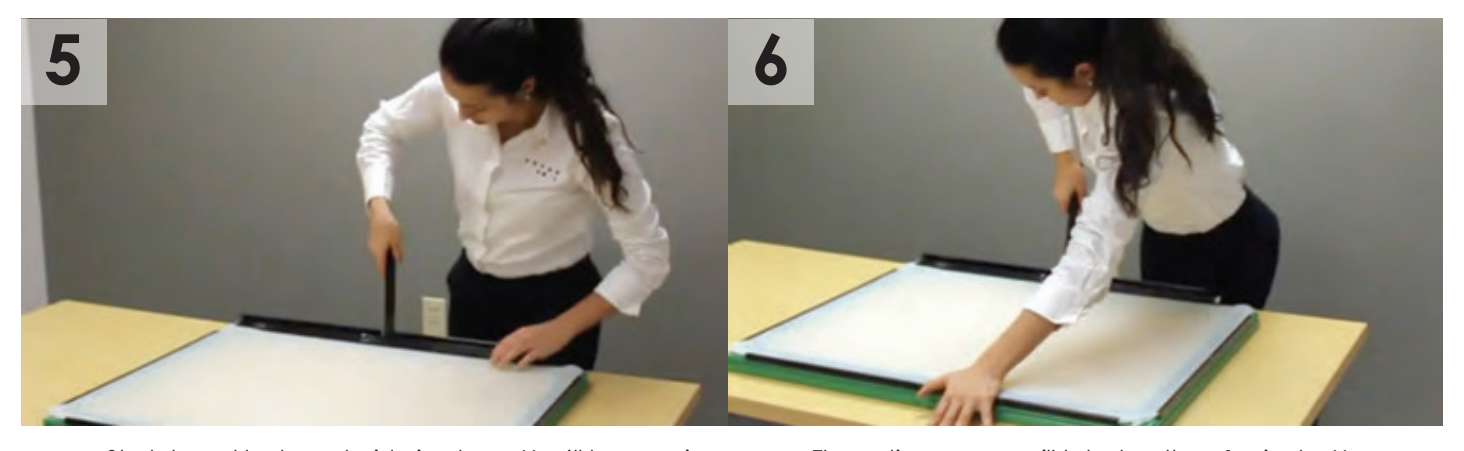
Stretch and lock each side in place. You'll hear a nice "snap" when the locking bar is in it's proper position.