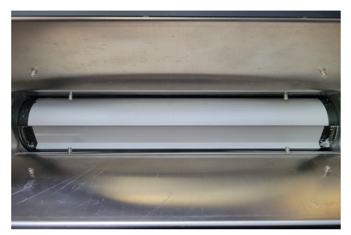
Powder box and TPU roller