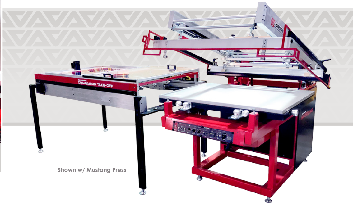
Shown w/ Mustang Press