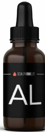
SCALPA PIGMENT LIT – AL #AL02 3mL bottle