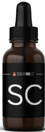
SCALPA PIGMENT LIT – SC #SC02 3mL bottle

This is a new color line introduced to complement our original SCALPA SMP Pigm set. This ink is best suited for clients whose skin is very light or very dark in color because the undertones of their skin are cool. SCALPA LIT is warm toned to offset their pigment and give the perfect results.