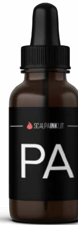
SCALPA PIGMENT LIT – PA #PA02 3mL bottle