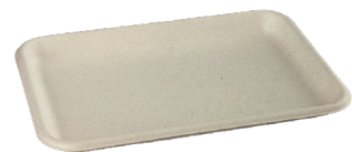
Sugarcane Tray Small (range includes 1 size)