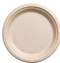
Sugarcane Plate (range includes 2 different sizes)