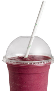
197mm Regular Paper Straw (6mm) White EPS-R-W