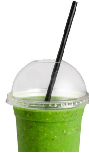
197mm Regular Paper Straw (6mm) Black EPS-R-B