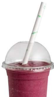
203mm Large Paper Straw (8mm) White with Individual Wrap - FSC® MIX EPS-W-WRAP