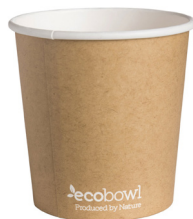
Paper EcoBowl (range includes 5 different sizes)