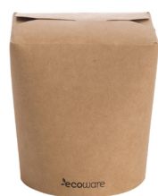
Kraft Noodle Box (range includes 3 different sizes)