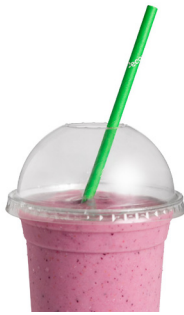
197mm Regular Paper Straw (6mm) Green EPS-R-G