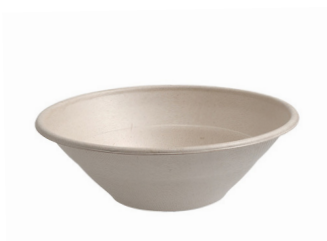
Sugarcane Bowl (range includes 3 different sizes)