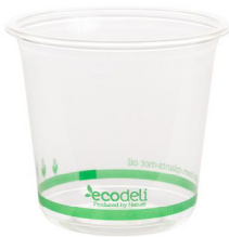
EcoDeli Bowl (range includes 4 different sizes)