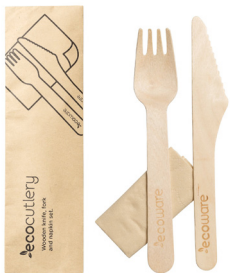
Wooden Knife, Fork and Napkin Set W-16SET