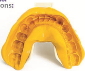
Good separation lines between teeth