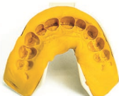
Too shallow impression because the material was too hard before inserted in the mouth

In Most of the cases it's very Important to have photos of the customers mouth and teeth to make the most suitable and matching veneers. So, please take few minutes to take those few photos and upload them to your online account or send them to photos@trusmileveneers.com