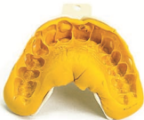
Distorted impression and showing walls of the tray