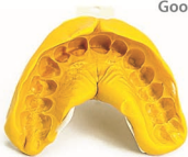
Well demarcated teeth borders