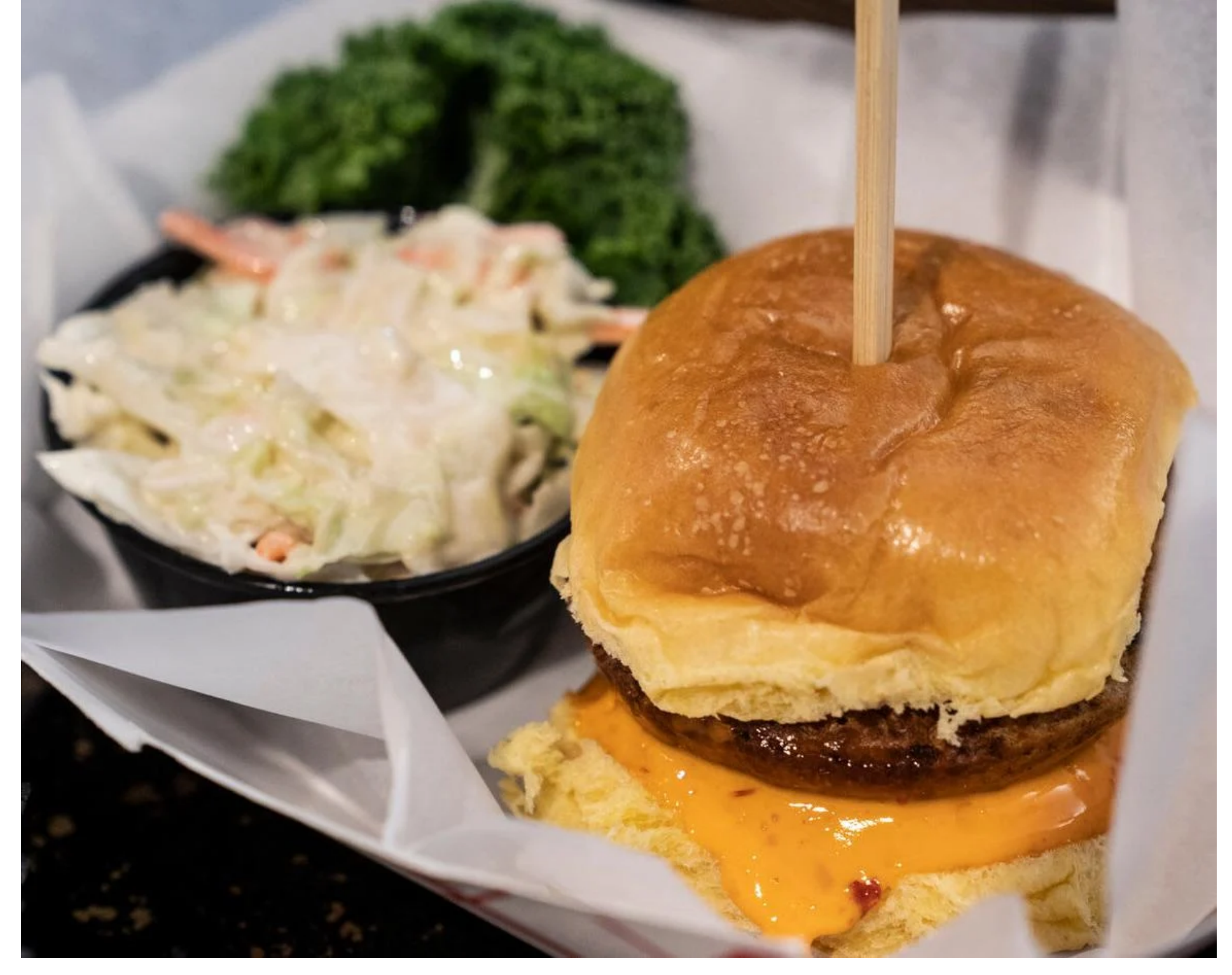
Crab cake sliders are a new food offering at the ballpark.