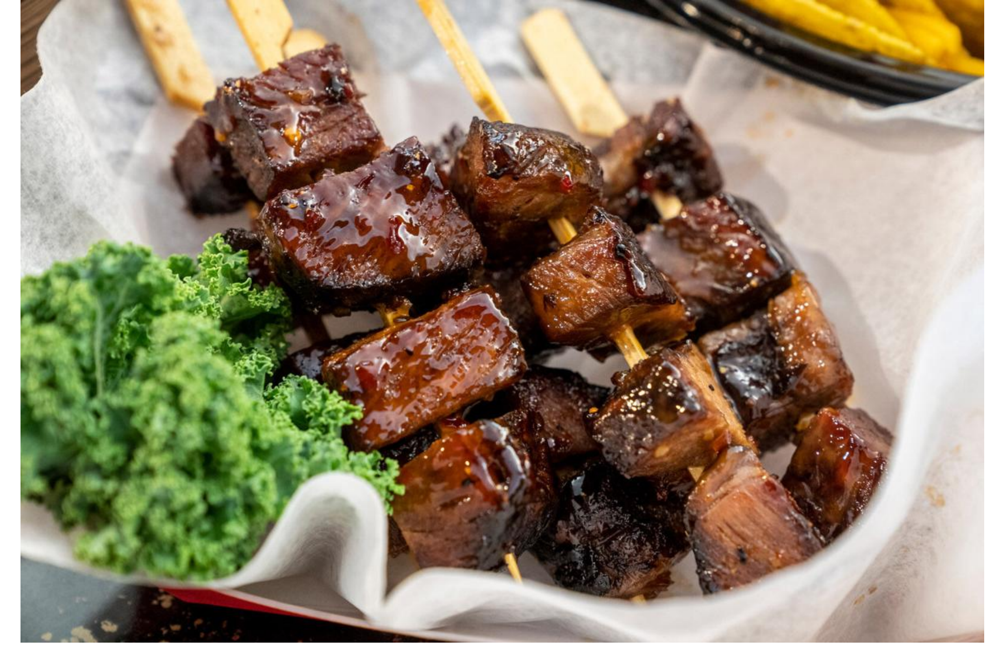
Short ribs new to the ballpark.