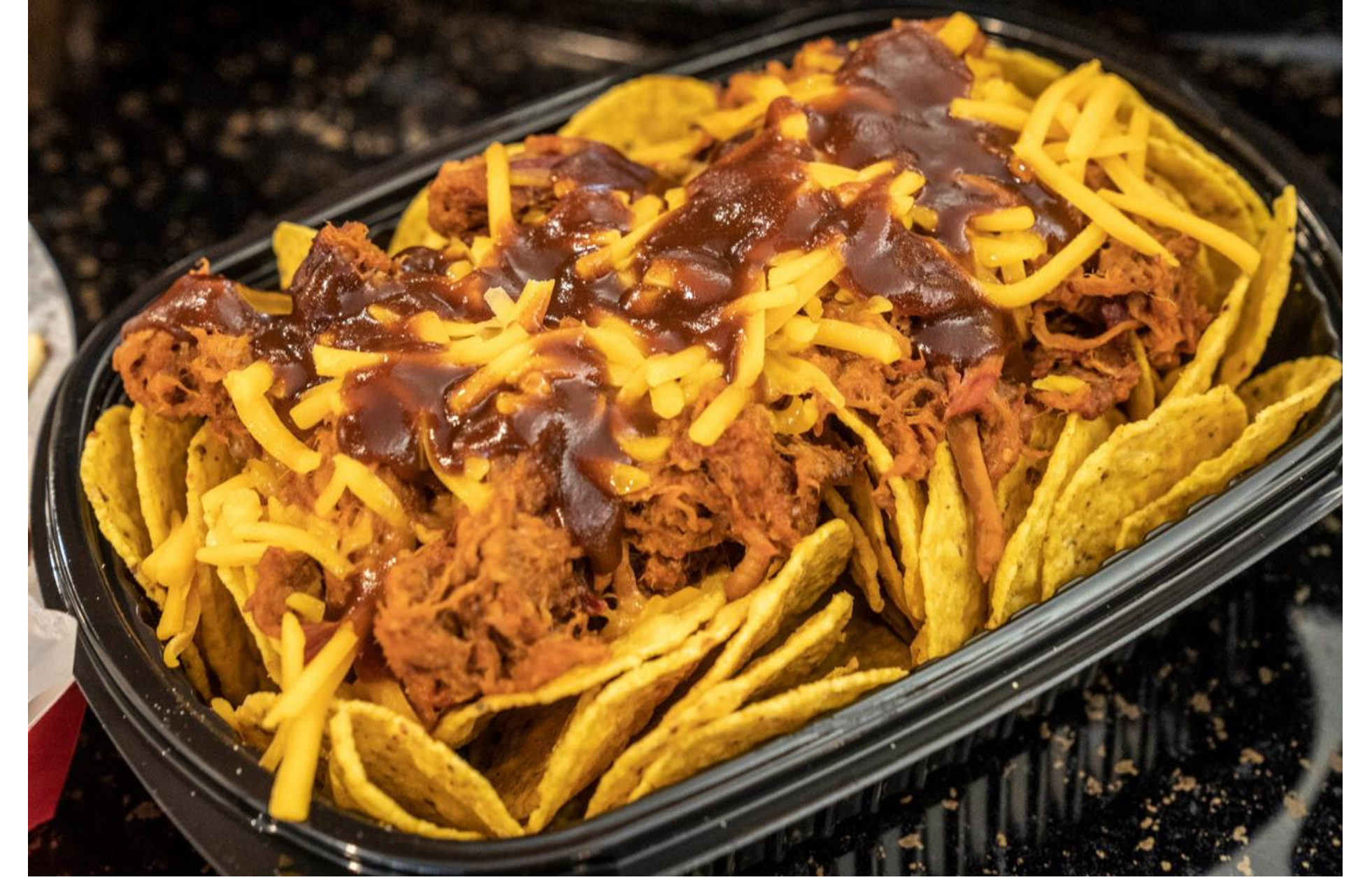
Pulled pork nachos are a new offering at Sahlen Field.