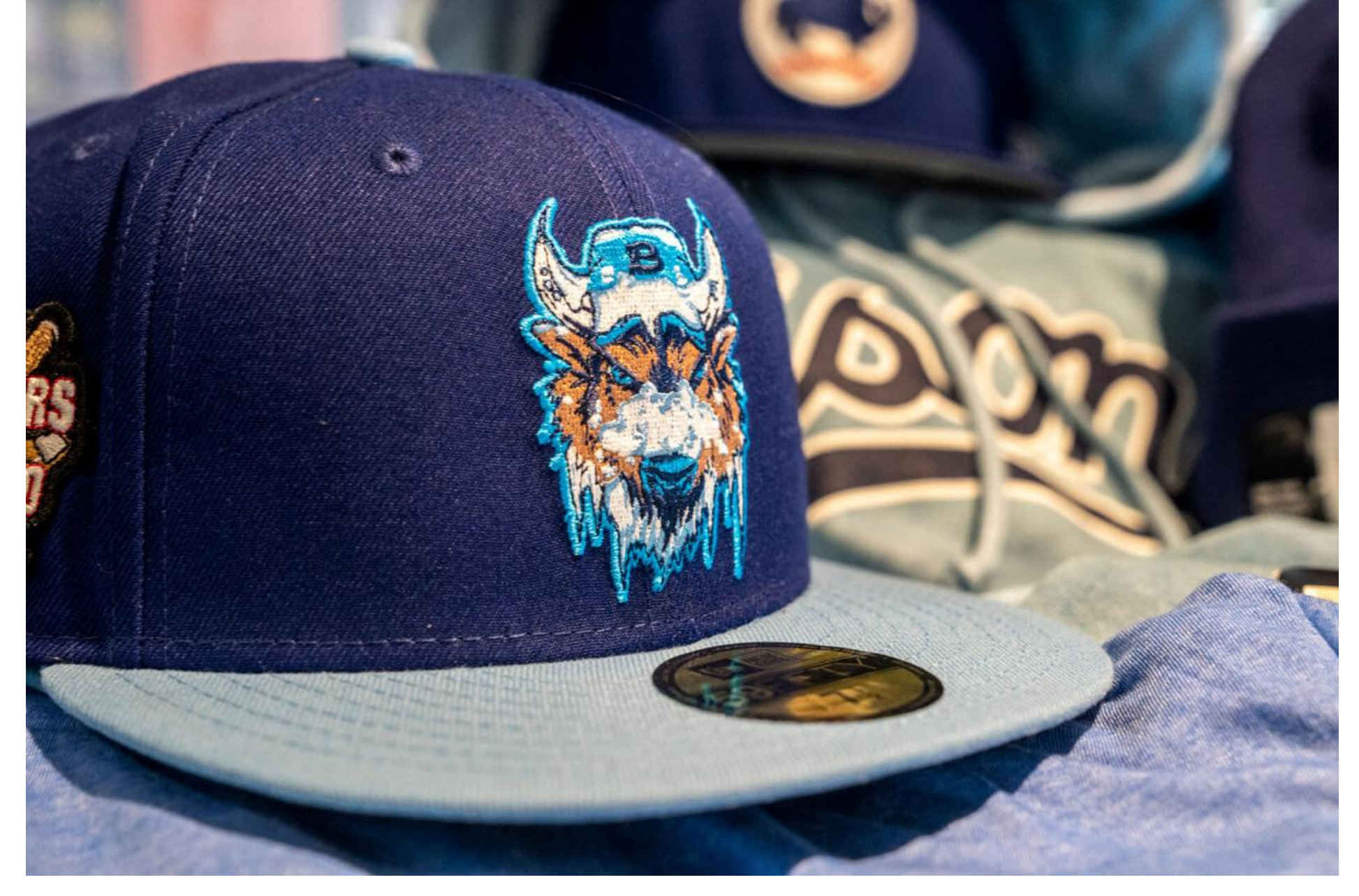
Buffalo Bisons unveil a new hat during the This is Bisons' annual "What's New at the Ballpark" news conference.