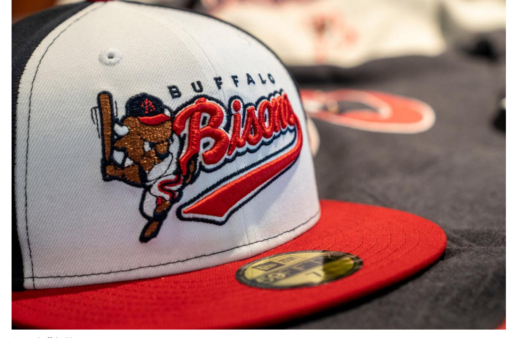
A new Buffalo Bisons cap.