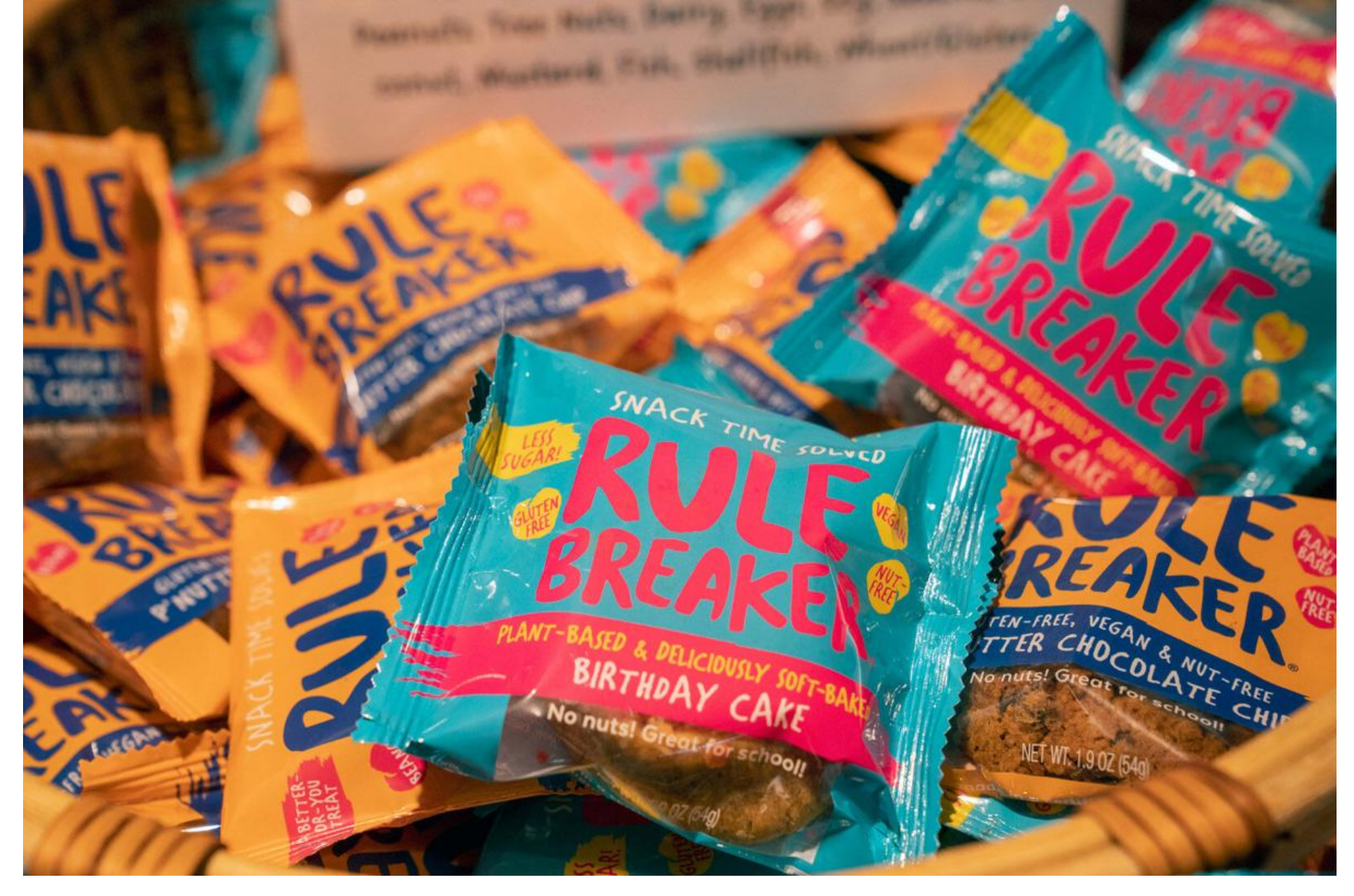
Rule Breaker snacks are new to the ballpark.