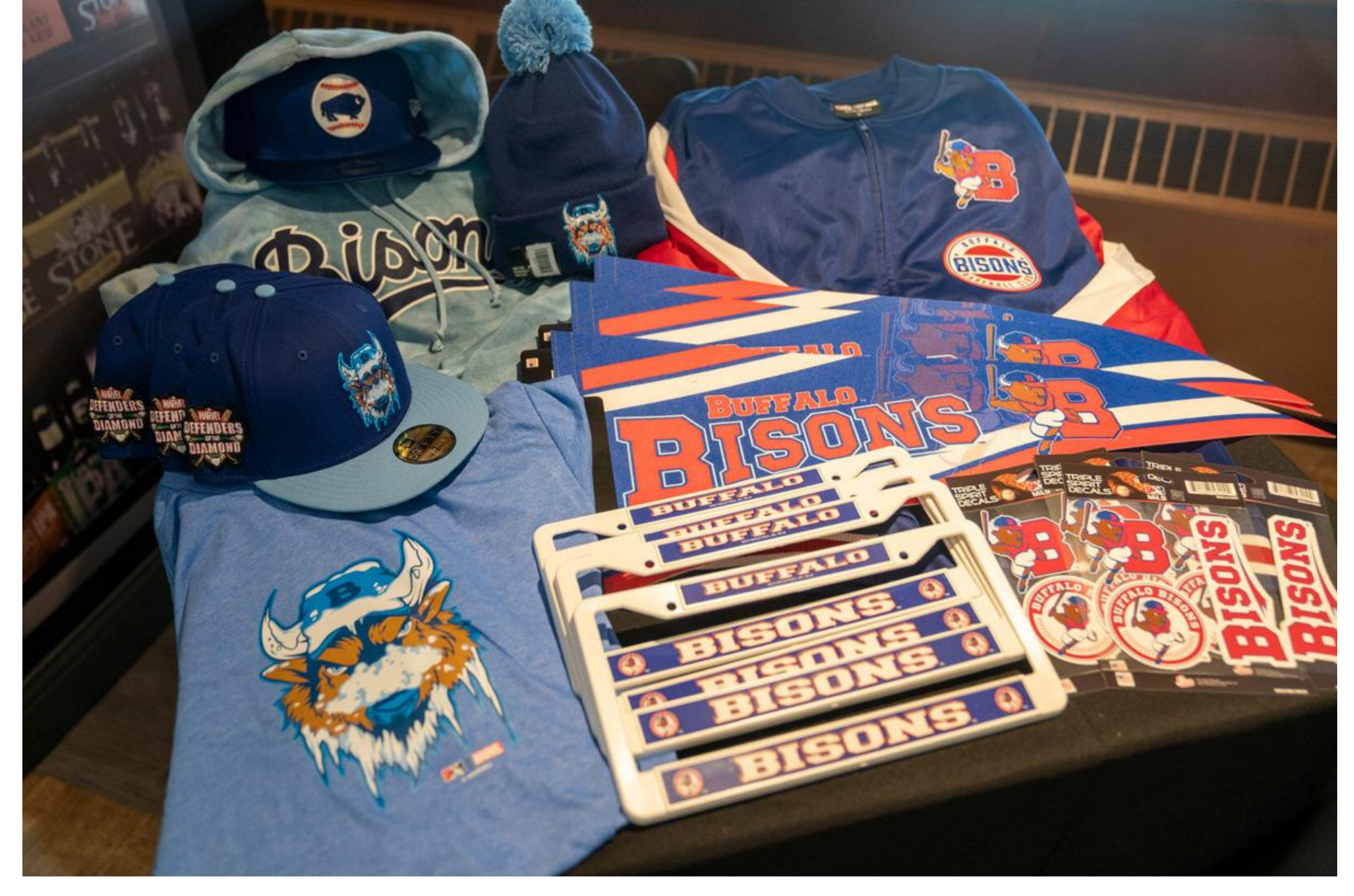
New Buffalo Bisons merchandise for the upcoming season.