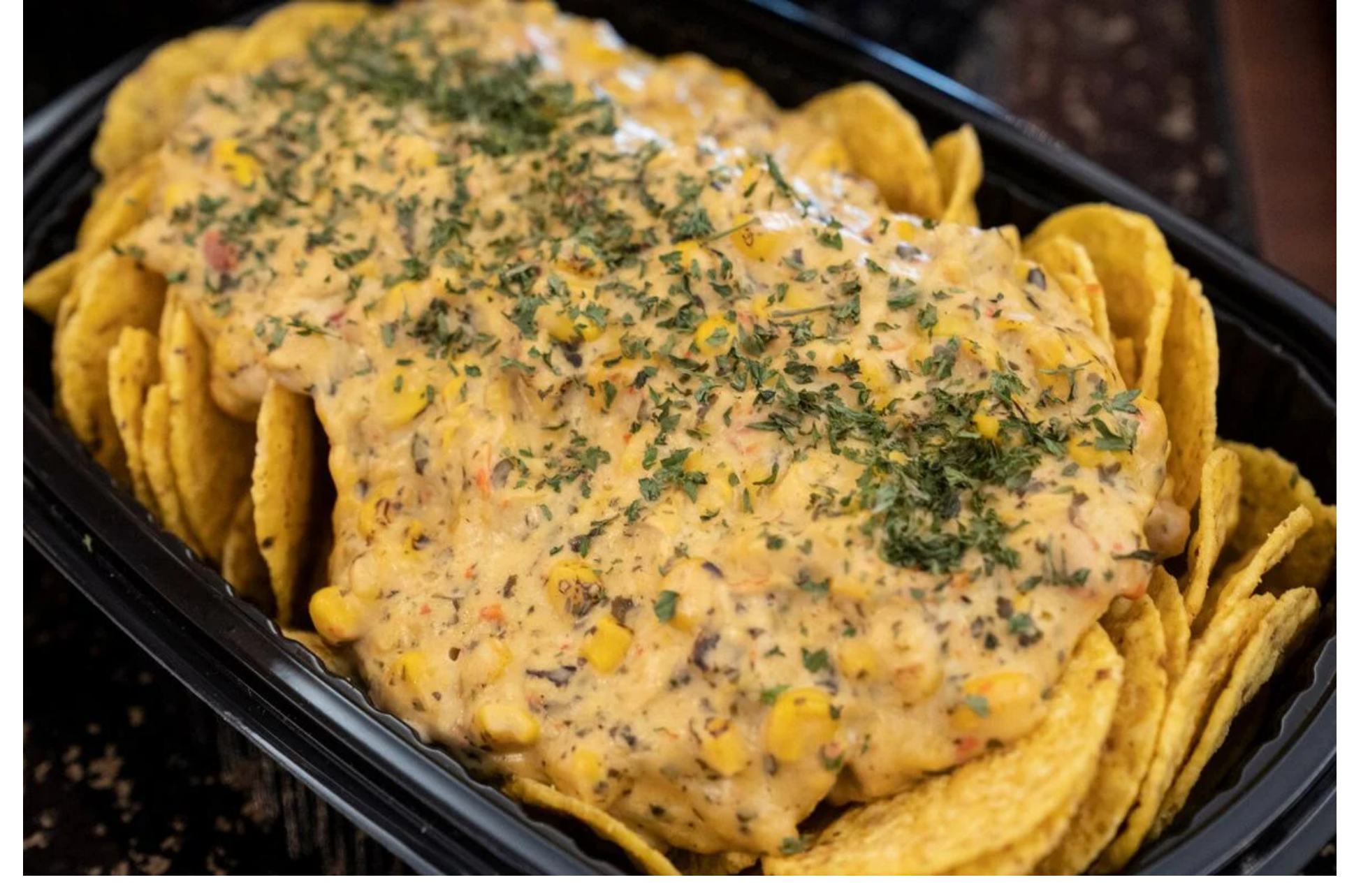
Corn salsa nachos are new to Sahlen Field.