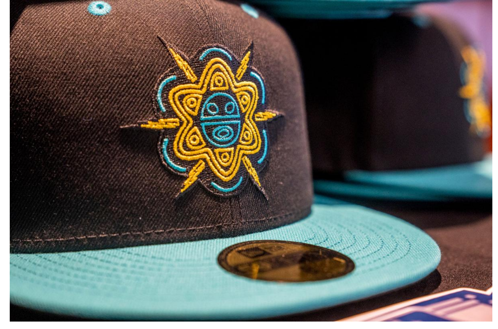
Buffalo Bisons unveil 'Luces de Buffalo' logo/team name/cap.