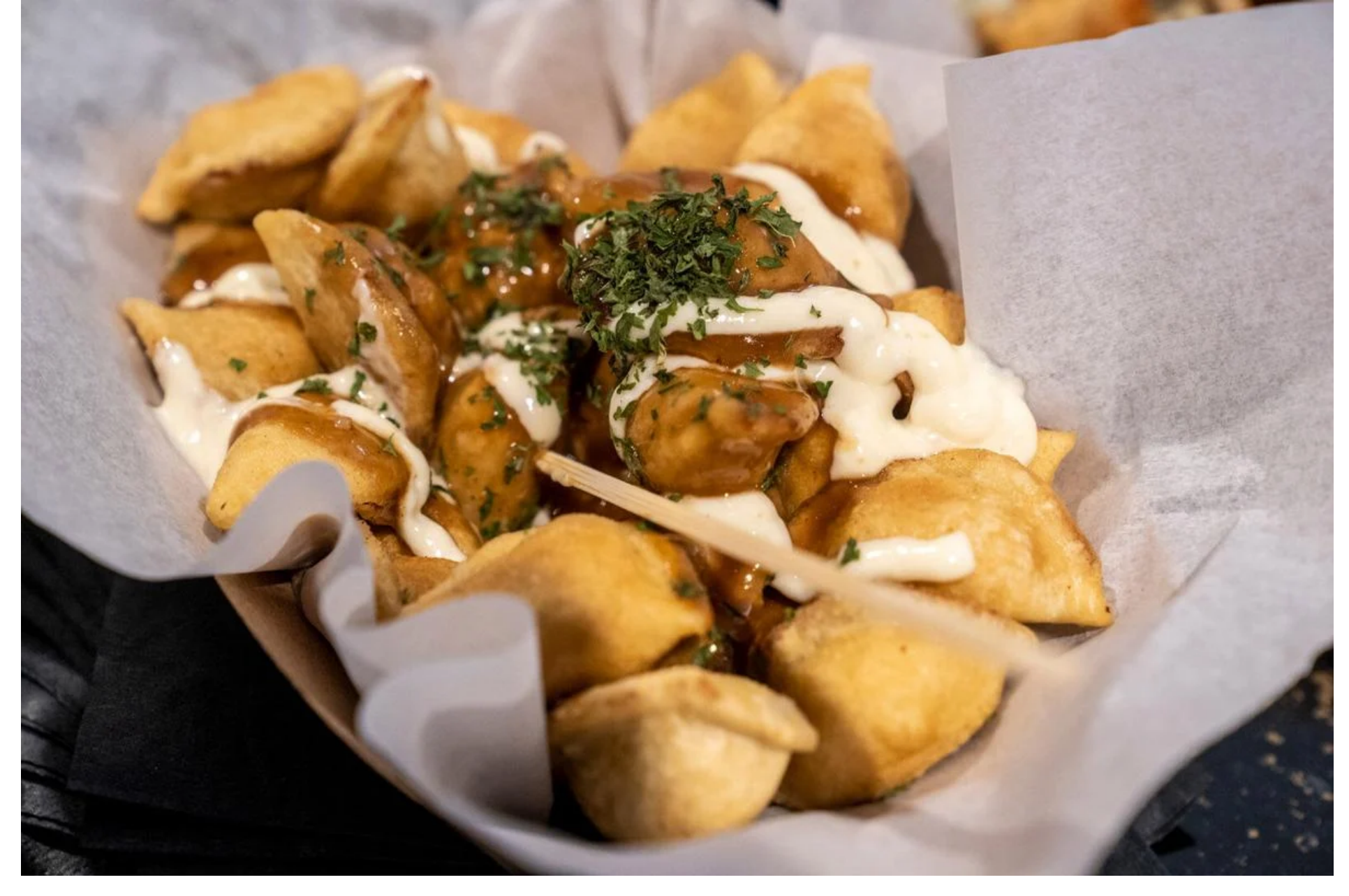
Beef pierogi will be a new offering at Sahlen Field.