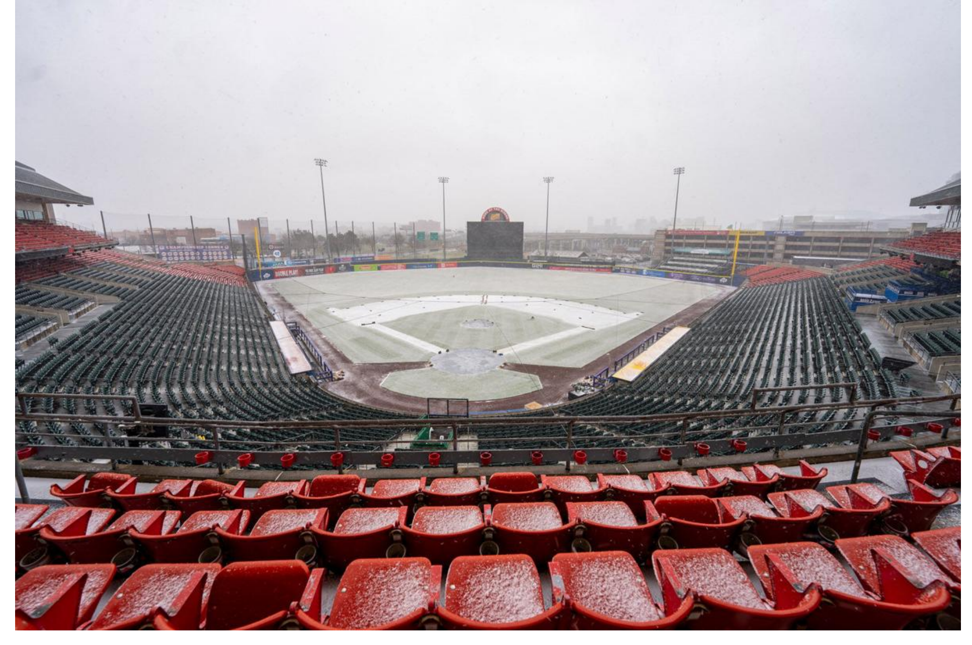
Snow falls at Sahlen Field on Tuesday, March 19, 2024.