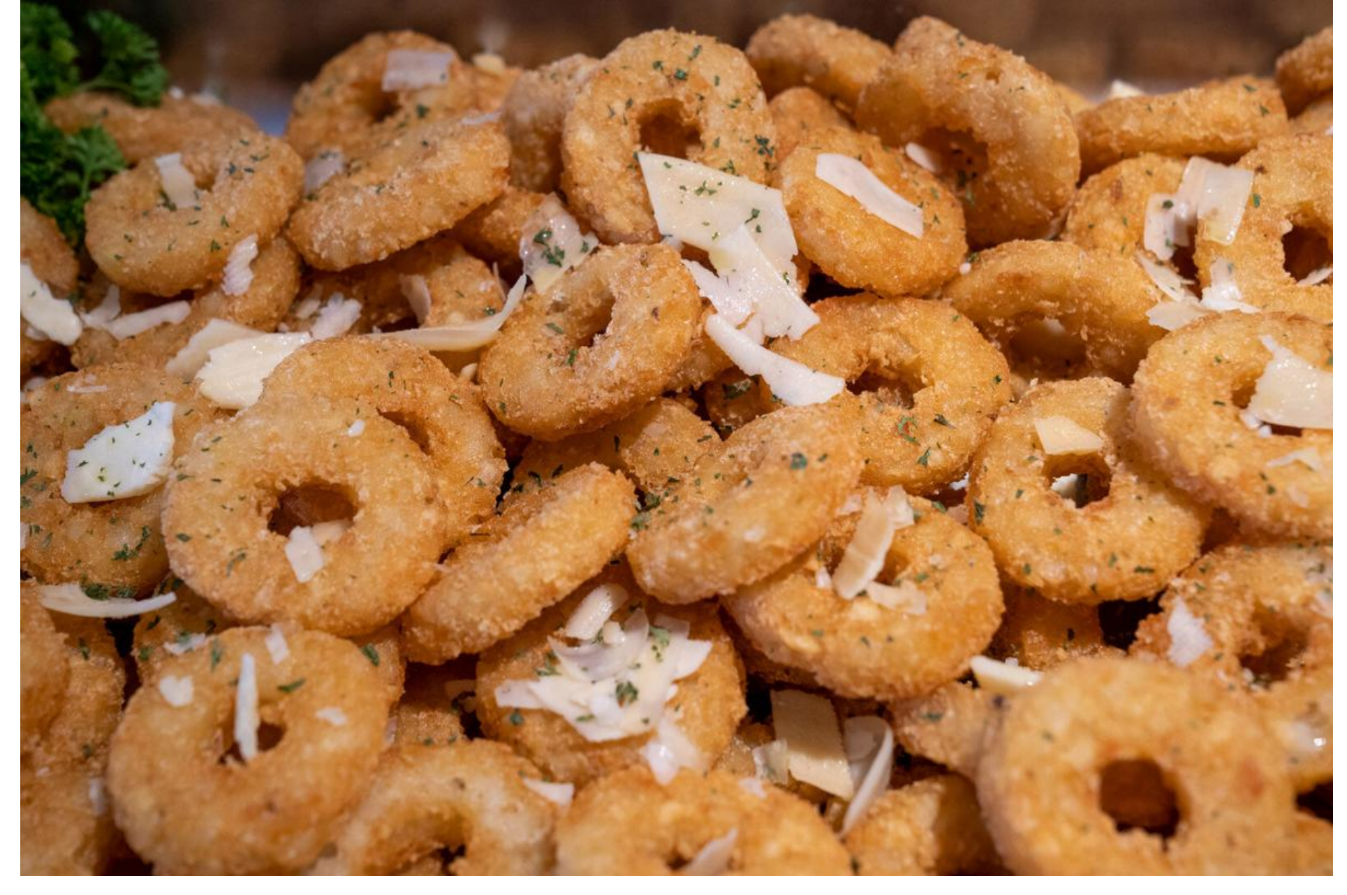
Potato rings will be new to the ballpark this season.