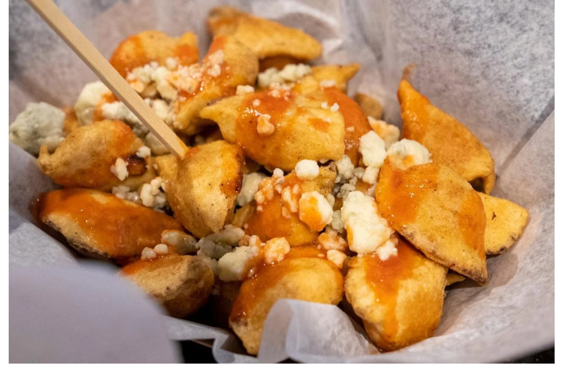
Cheese pierogi will be a new offering at the ballpark.