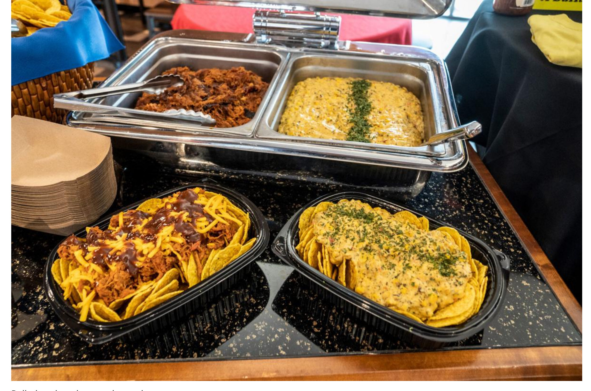
Pulled pork and corn salsa nachos.