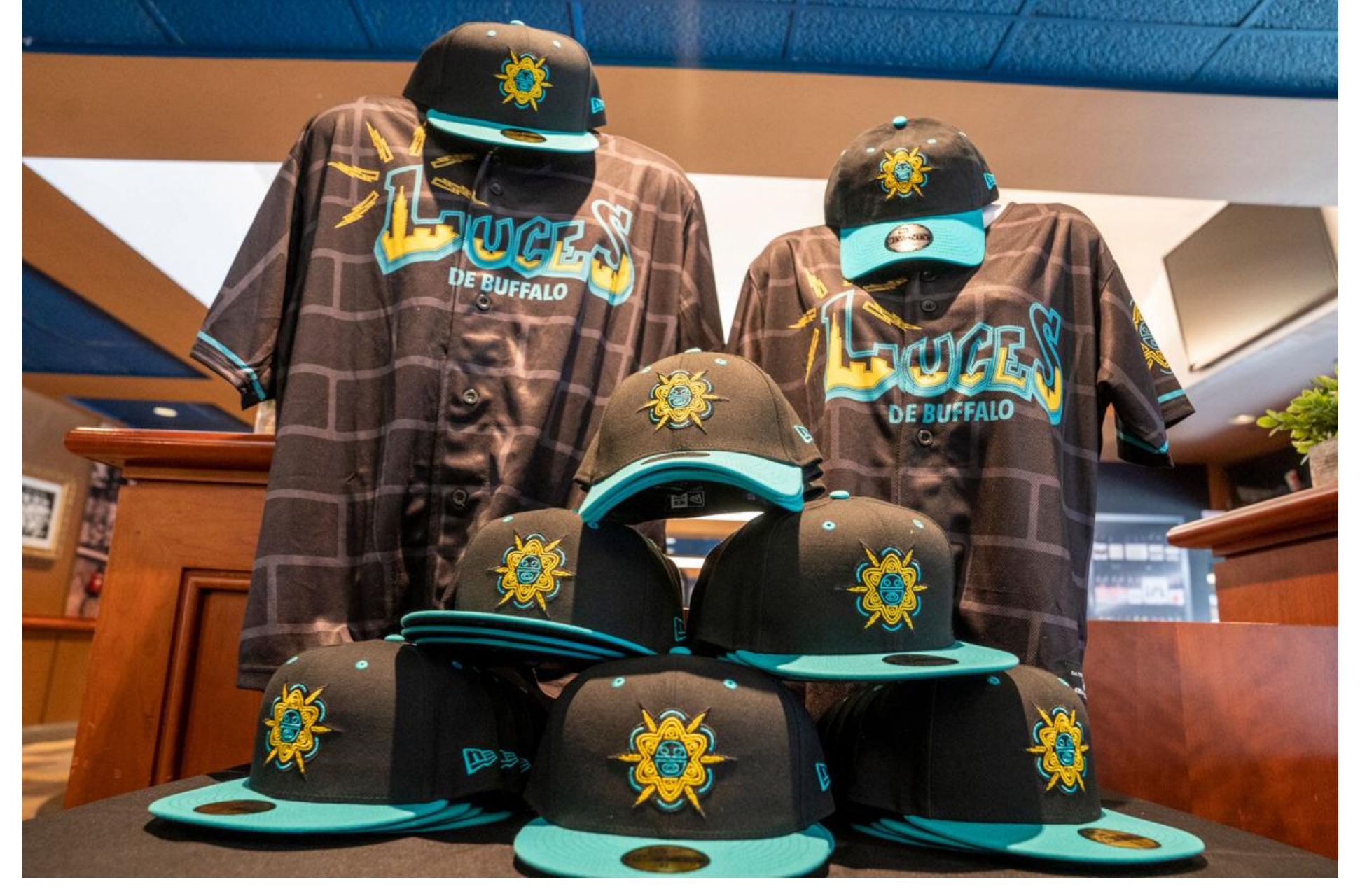
Buffalo Bisons unveil 'Luces de Buffalo' logo/team name uniforms and hats, during the This is Bisons' annual "What's New at the Ballpark" event.