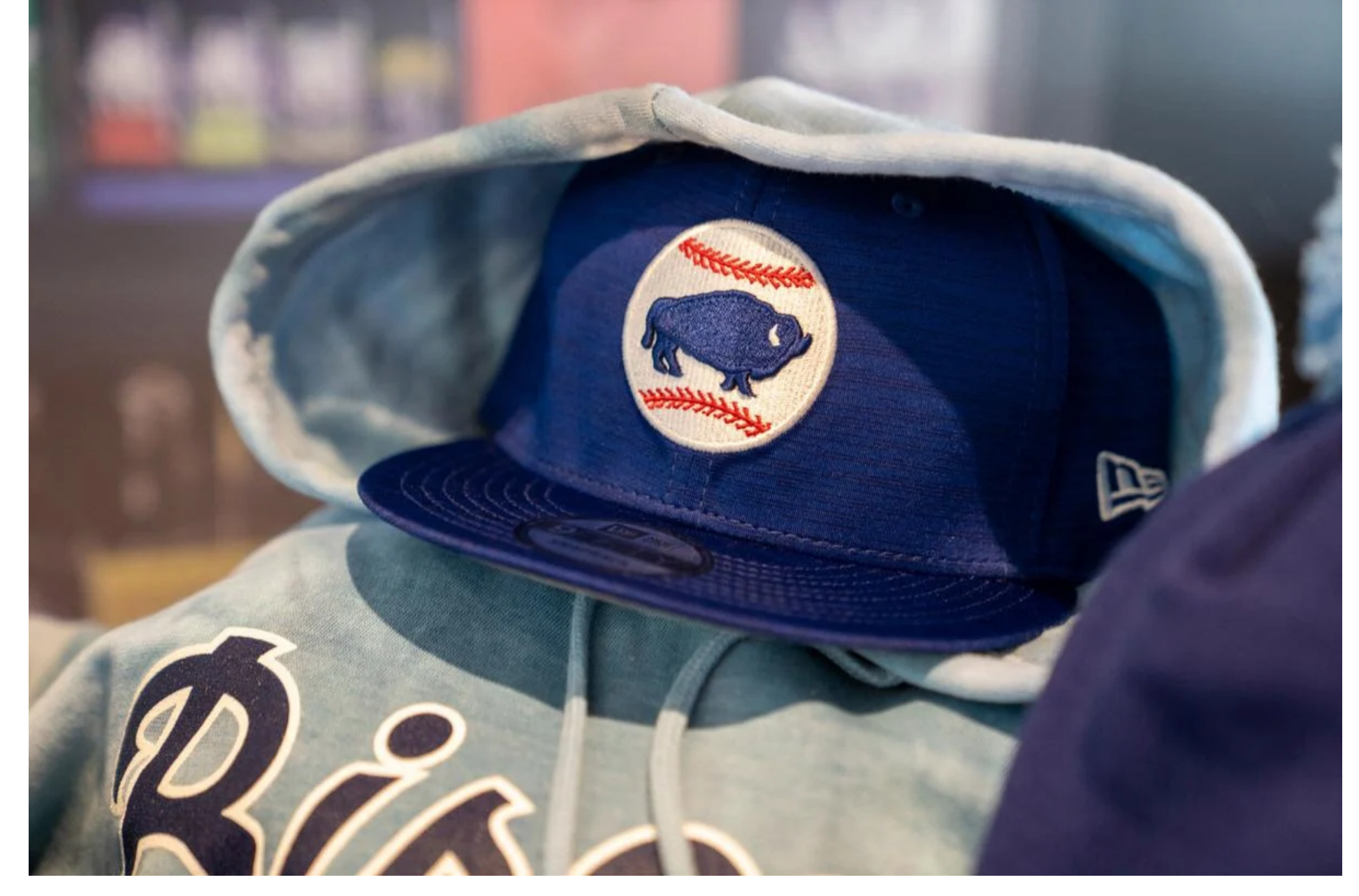
A new Buffalo Bisons hat for the 2024 season.