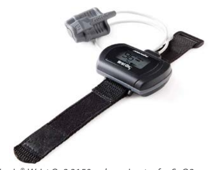
Nonin® Wrist Ox2 3150 pulse oximeter for SpO2 integration