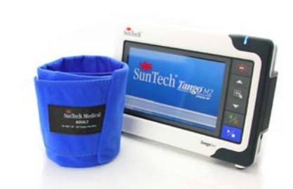
Suntech Tango® blood pressure monitor allows to integrate several parameters, including SpO2