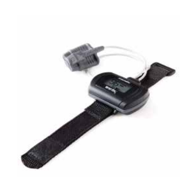
Nonin® WristOx 3150 pulse oximeter for walking and titration tests