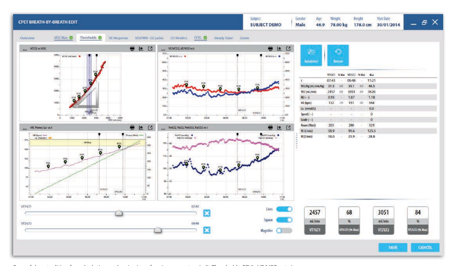
Powerful\ post\ editing\ for\ calculation\ and\ reviewing\ of\ main\ parameters\ (edit\ Thresholds,\ EFVL,\ VE/VCO_{2}\ etc.)