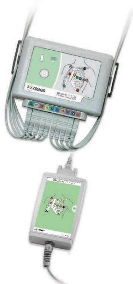
During\ exercise, Quark\ CPET\ can\ perform\ pulmonary\ gas\ exchange\ measurements\ with\ integrated\ ECG\ data