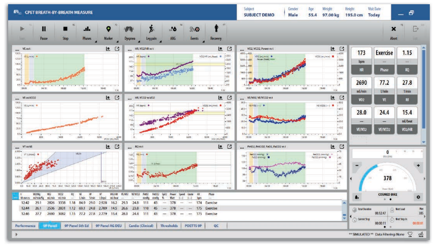
Possibility to manage/display in real time data and plots via dashboards (default and user defined)