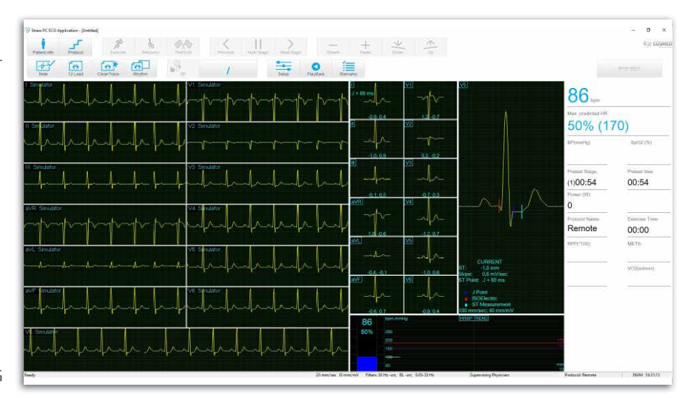
Real-time display of 12-lead waveforms for a synchronous recording of ECG and ergospirometry parameters