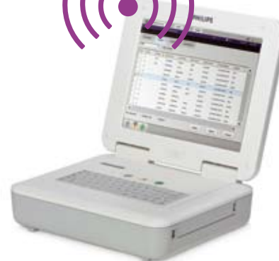
PageWriter TC70 Cardiograph