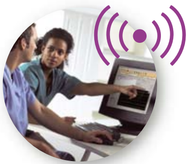
TraceMasterVue ECG Management System