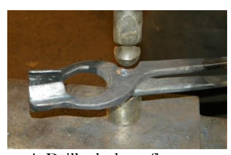
4. Drill a hole to fit your rivet and rivet both blanks together.