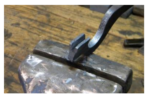
(Should look like this)