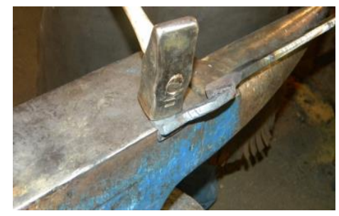
2. Shape the jaw on the anvil. They can be square,