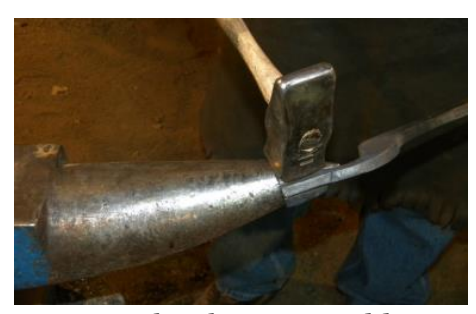
or make them round by using the horn of the anvil.