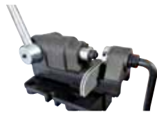
Base Clamp Plate with Spinner