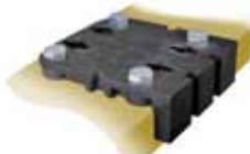
Base Clamp Plate mounted to bench