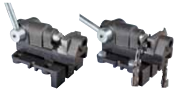
Base Clamp Plate with Breaker