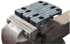
Base Clamp Plate held in vice

Use with GB Spinner .404" & 3/4" : GBCS-100 Use with GB Breaker .404" : GBCB-404-100 Use with GB Breaker 3/4" : GBCB-3/4-100 Use with GB Spool Holder : GBCH-100