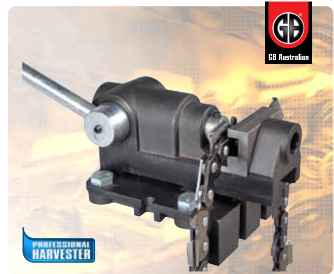
Part No. GBCB-3/4-100