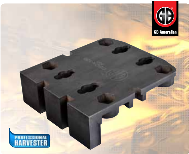
Part No. GBCA-100