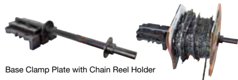
Base Clamp Plate with Chain Reel Holder