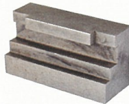
GBCB-404-101 .404" Anvil