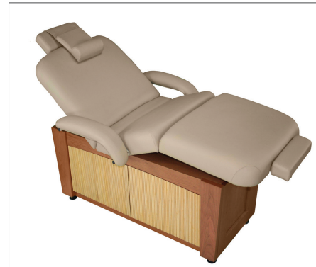
OPTION: Bamboo doors offer an attractive contemporary accent.