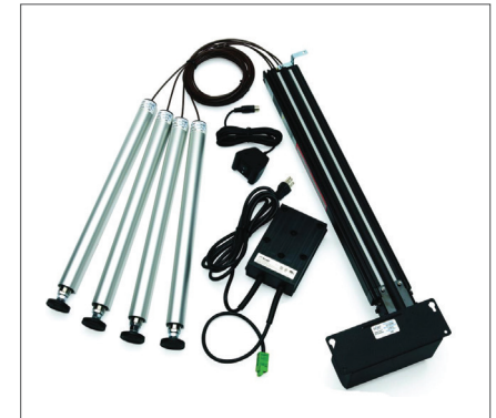
Powered by a hydraulic lifting system.