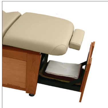
OPTION: End Drawer/Shelf- Extra storage space. Made to fit appliances 13.5" wide, 18" deep, and 8.5" high."

OPTIONS & ADD-ONS: Viola PowerTilt, Bamboo Cabinet 11651 End Drawer/Shelf 990-051