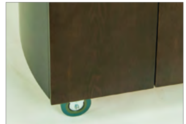
Heavy duty locking casters easily roll over thresholds.