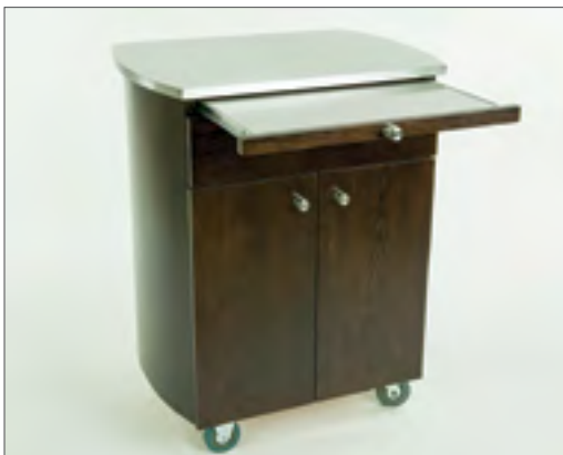
Stainless steel pull-out shelf offers an additional work surface.