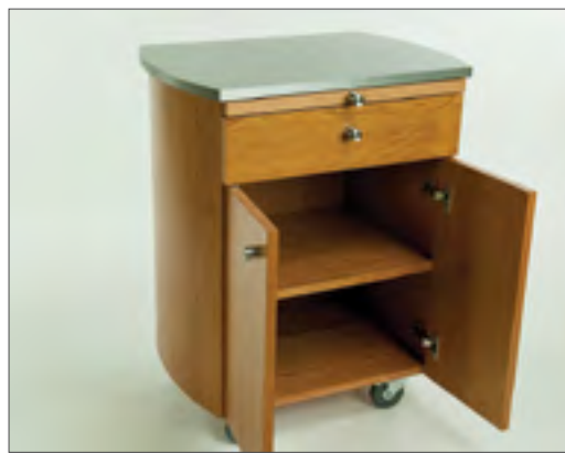
Ample storage space for linens, towels, and products.