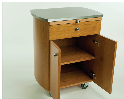
Ample storage space for linens, towels, and products.