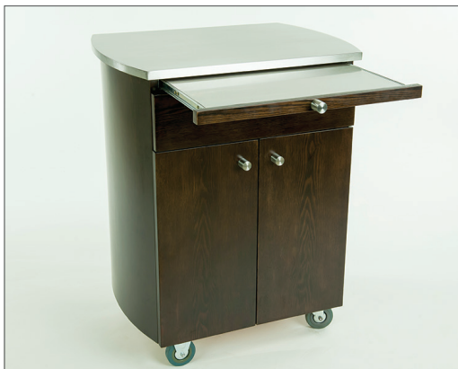
Stainless steel pull-out shelf offers an additional work surface.