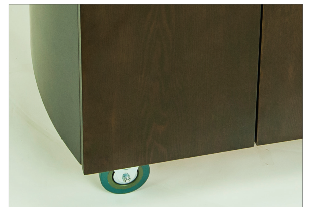
Heavy duty locking casters easily roll over thresholds.