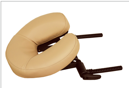
Optional FaceSpace face cradle and Salon foot rest for optimal comfort.