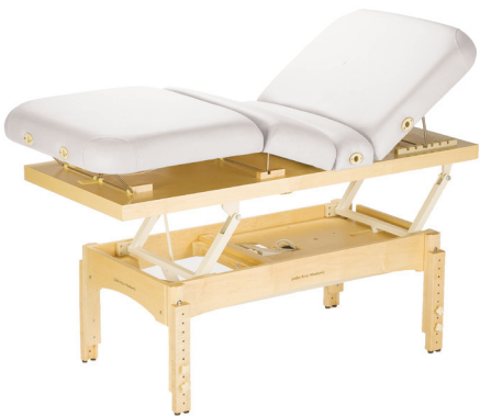
Custom salon top with manually adjustable knee and back available with an extended lead time.

OPTIONS & ADD-ONS: Extra Foot Pedal Option 98-79011 Olympus Shelf Upgrade 13010-SHELF