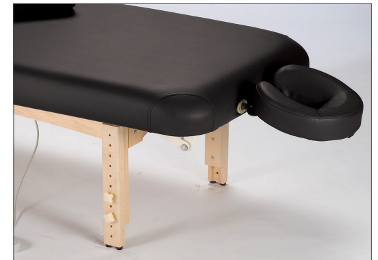
Custom low leg option available.