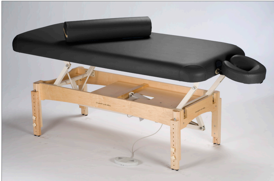
Shown with optional accessories.

The Olympus Flat Top offers a motorized lift for massage and bodywork. Using a combination of manual and electric height adjustments, the Olympus provides the greatest height range in the industry, and is fully ADA compliant.