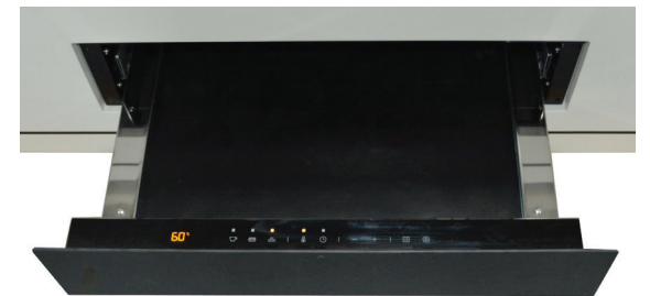
Optional storage drawer shown.