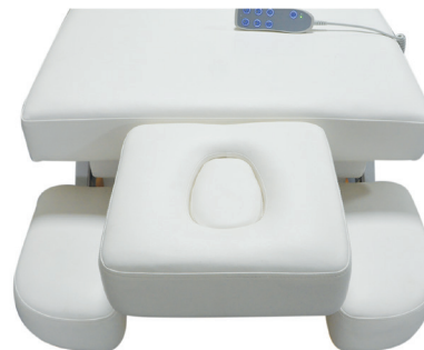
Hydraulically-adjustable face support