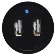
Convenient USB connectors built in

Contact TouchAmerica's sales team to learn more about tailored sheet sets for the MESA.