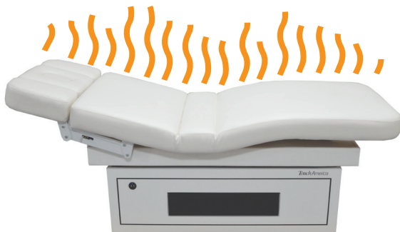
Fully integrated heating