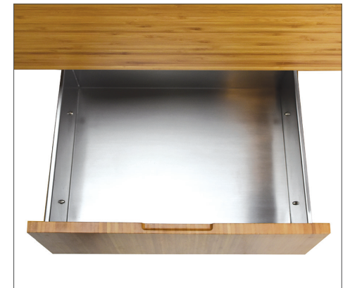
Warming drawer keeps towels and heat transferring products warm and ready.