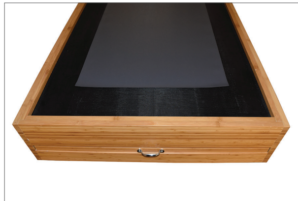
Professional-grade 220-watt heater rests under the salt, providing warmth and releasing the salt's healing negative ions.