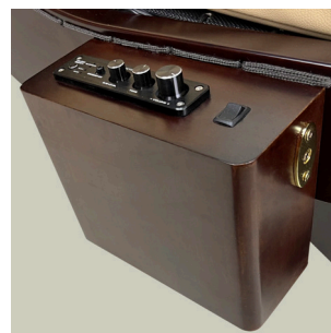
Amplifier for both packages supplies full-body sound for an extraordinary experience.