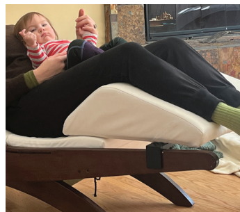
Optional one piece footrest allows zero gravity relaxation in the spa or at home!