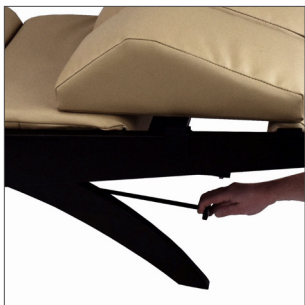
Lock for rocking motion can be engaged or disengaged from foot section. Second lock handle accessible while sitting in lounge.