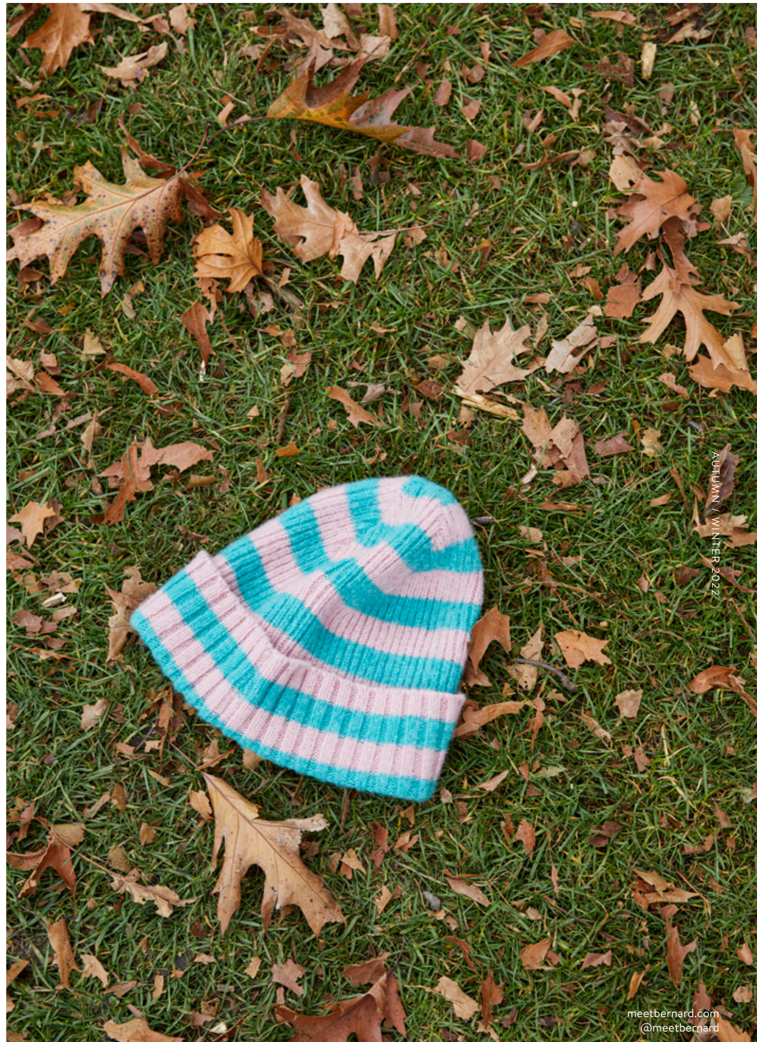
Top left and bottom right. Bags by Als. Top right. Belt by Essentiel Antwerp. Bottom left. Bag by Ganni. Opposite. Hat by Howlin'