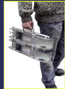
Handle it like a carrying case