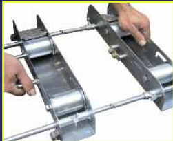
Tighten the shoes again