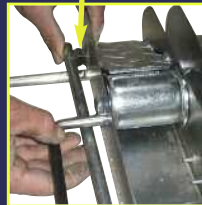
Fold the 1 st bar again