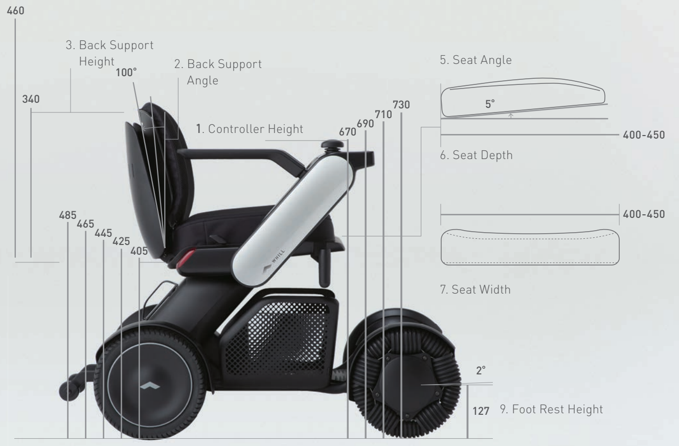
4. Seat Height

The Model C2 can be easily adjusted from seat height and back support angle to controller position (right or left drive) to provide a comfortable driving experience.