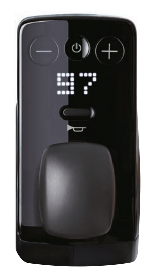
Modern, intuitive controller

Turn the power on and control the speed with one hand. The WHILL will automatically brake when you release the controller, even on an incline.