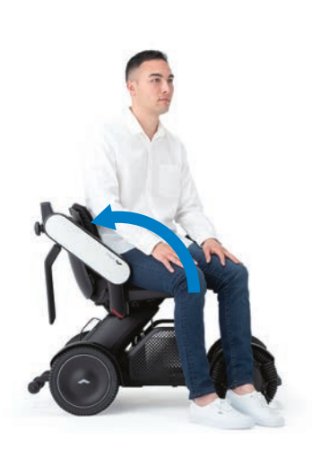
Retractable arm rest Lift up the arm rest to easily sit down in the chair from the side. Stand on the foot rest for added stability.