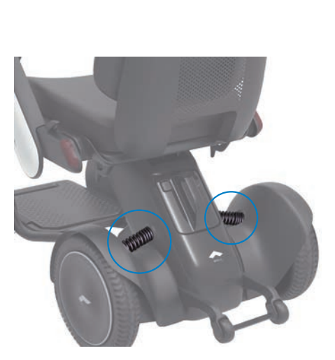
Rear wheel suspension absorbs the impact when driving over bumpy roads or obstacles.