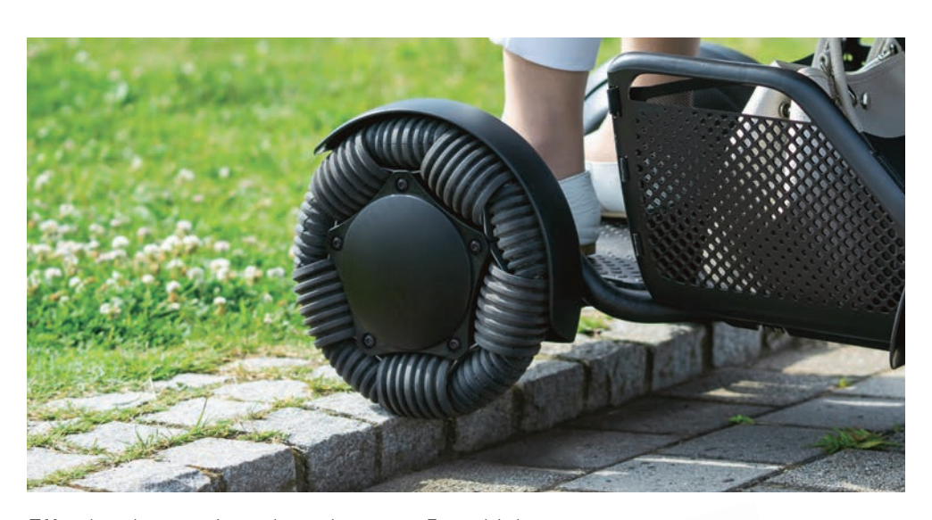
Effortlessly negotiate obstacles up to 5 cm high.

Thanks to its two powerful motors and innovative wheels, the WHILL Model C2 can be used on terrain that a standard wheelchair can't handle. Holes in the road, uneven terrain, grass and gravel will no longer be an issue.