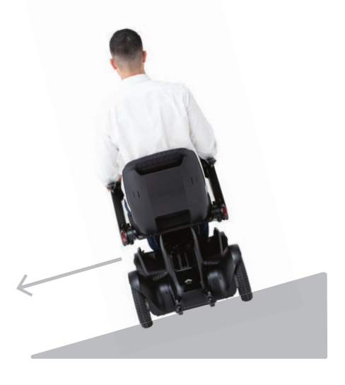
The WHILL Model C2 is designed to prevent drifting. Drive straight on a tilted path.