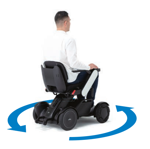
76 cm turning radius The WHILL is easy to manoeuvre and can navigate tight spaces, making it ideal for use in small indoor areas.