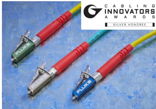
金属 LC 连接器

The Metal LC connector is compliant with IEC 61754-20 and TIA-604-10B intermateability standards. 该锁扣还经过了多达 10,000 次插入测试，其性能没有下降，且通过了所有 Telecordia GR-326-CORE 耐久性测试，包括热力、湿度、振动、弯曲、冲击和盐雾测试。 While the connector itself is rugged, the glass fiber endface is still susceptible to damage, so it's important to inspect the endface to make sure it's contaminant-free and to properly clean it if necessary.