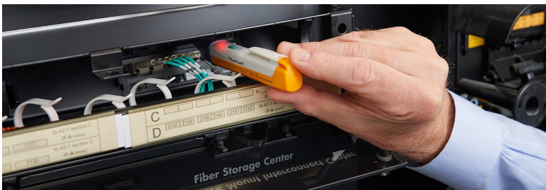
Determine if a port is live. Small size makes it easy to access cramped patch panels.