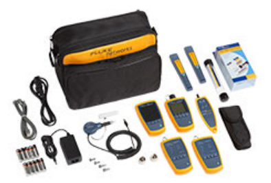
FKT1475 Complete Fiber Verification Kit