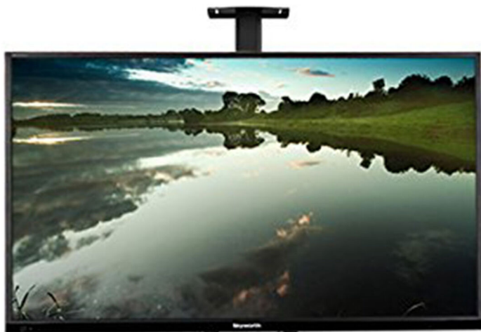
BIG TV Trolley