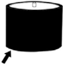
FT-381B (57 lbs) 13.5"W x 10.5"H

4a - Note: Using the handle of a screwdriver or hammer works best to press the stopper in place.