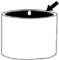
FT-381A (6 lbs) 11.75"W x 1"H

Step 8 - Evenly spread the pebbles over the water feature.