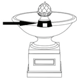
FT-282B (8 lbs) 8.5"W x 5"H

Step 6 - Place the pump cover (FT-282B) over the pump and in the center of the large bowl (FT-282D).