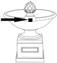
FT-282C (2 lbs) 4.5"L x 1"W x 3.75"H

Step 8 - Center the finial (FT-282A) on the pump cover (FT-282B).