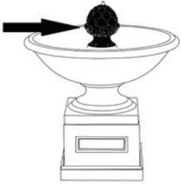
FT-282A (15 lbs) 6.5"W x 10.25"H

Step 7 - Connect the 5/8" clear tubing to the copper pipe protruding from the bottom of the finial (FT-282A).