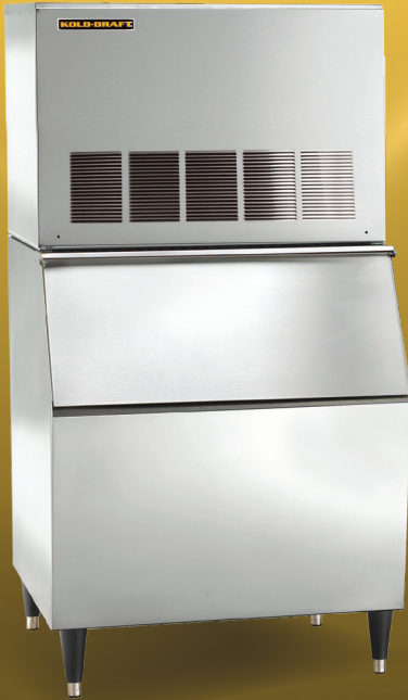
SHOWN WITH B400 BIN

ice Machines • bins • crushers • dispensers