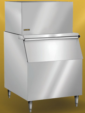
SHOWN WITH B400 BIN

ice Machines • bins • crushers • dispensers