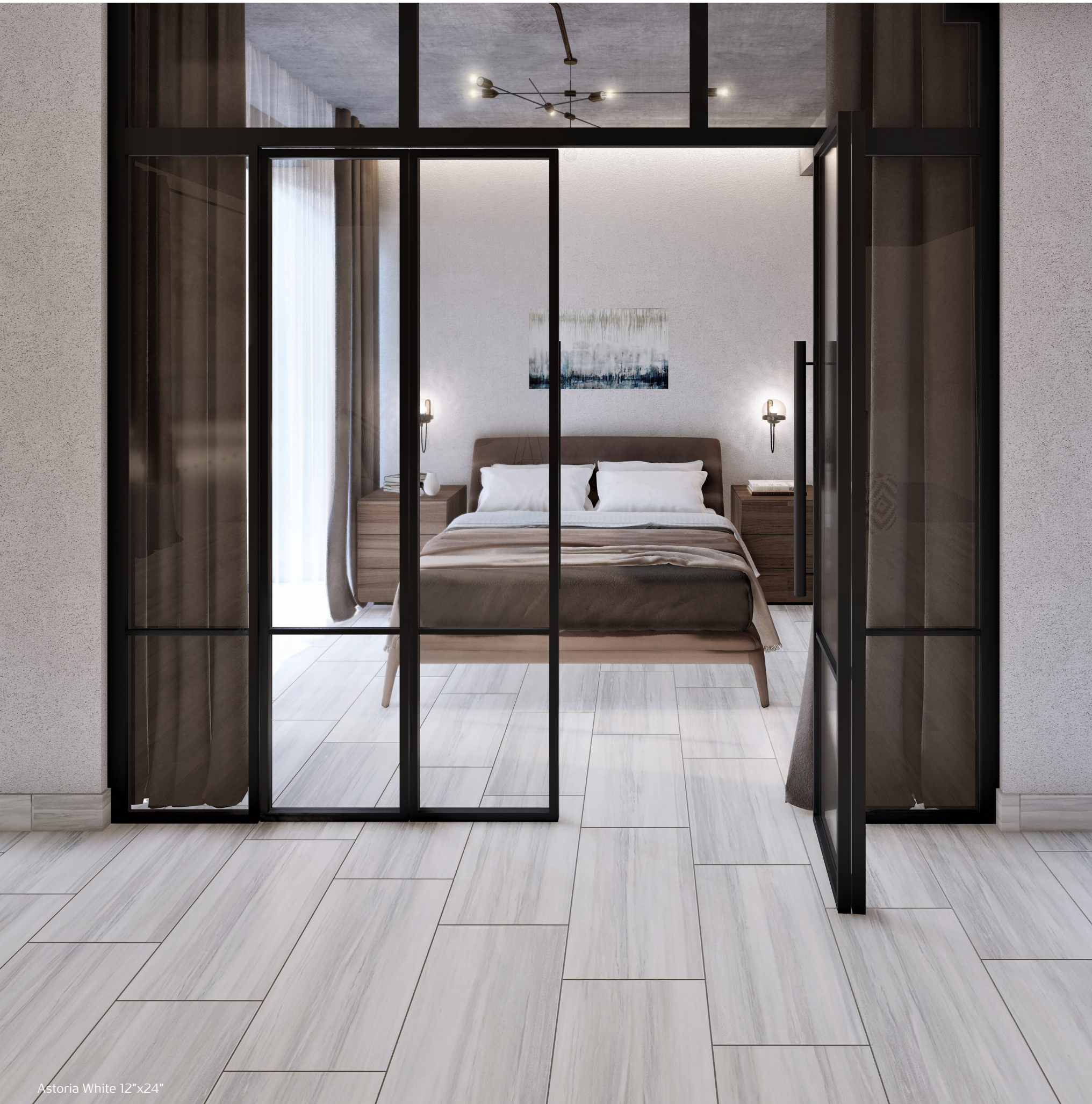
Astoria White 12"x24"

An abstract proposal away from classic white marbles. Ideal for minimalist spaces, reinvented from an Antique stone to a contemporary look by using neutral soft tones.