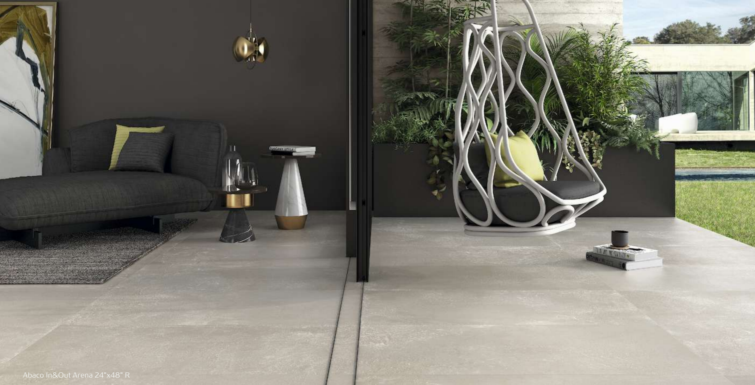
Abaco In&Out Arena 24"x48" R