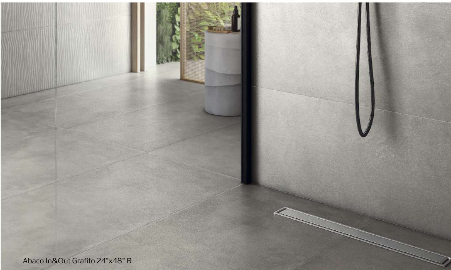
Abaco In&Out Grafito 24"x48" R