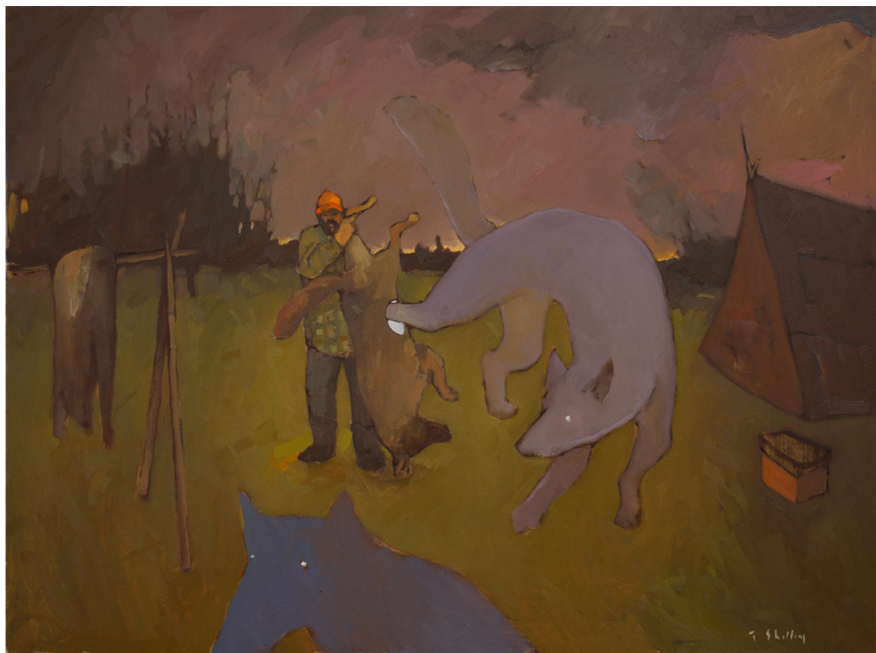
Travis Shilling "Spirit #2" 2012 oil on canvas 30 x 36