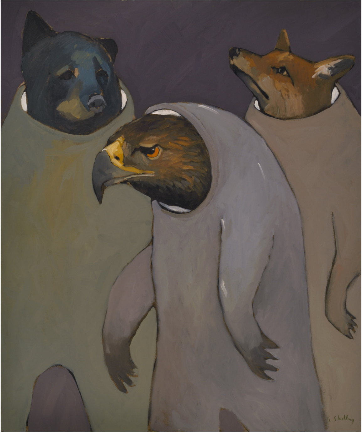
Travis Shilling "The Visitors" 2017 oil on canvas 48 x 40