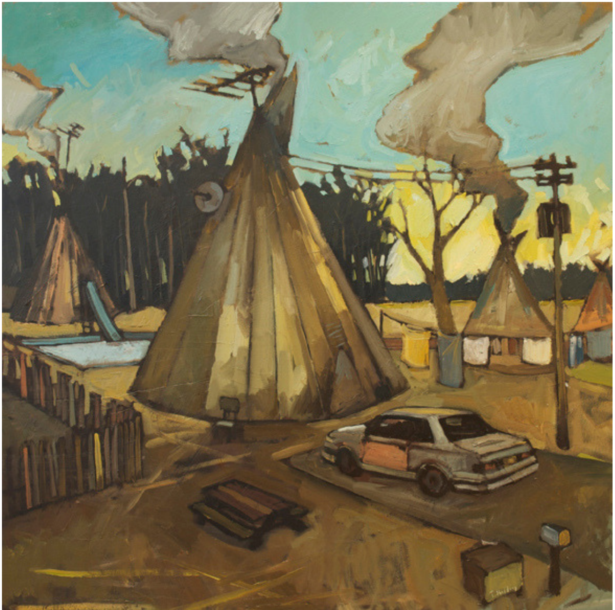
Travis Shilling "Evening" 2012 oil on canvas 40 x 40