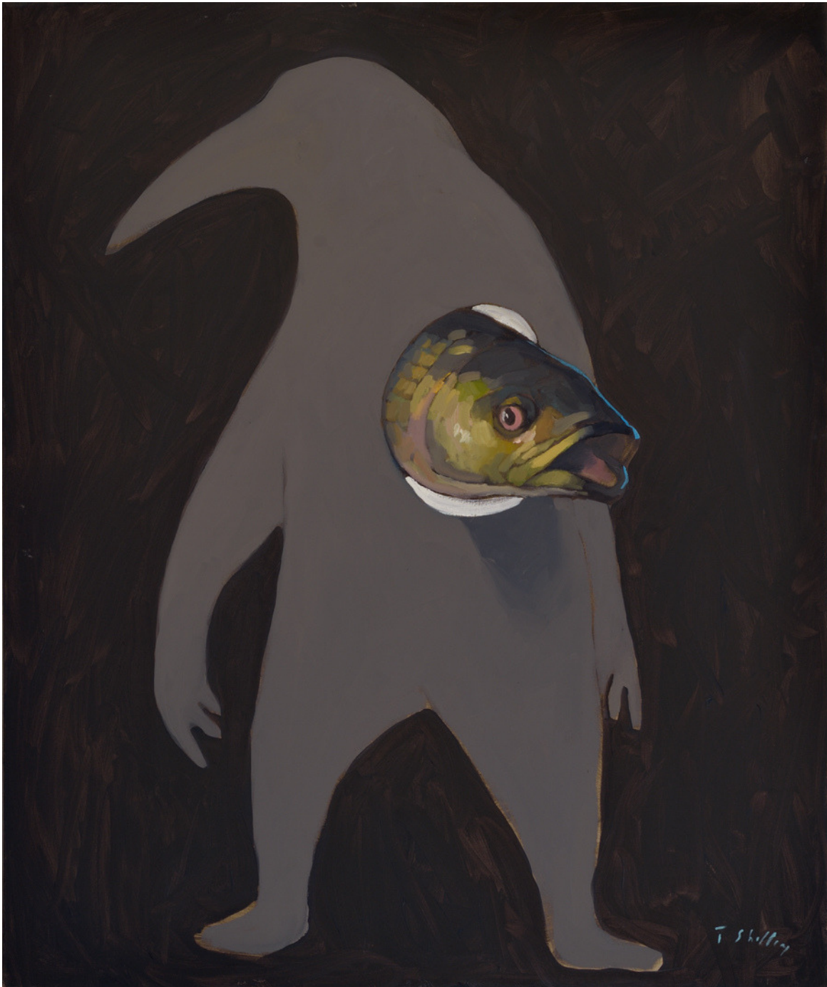
Travis Shilling "The Visitor" 2017 oil on canvas 48 x 40