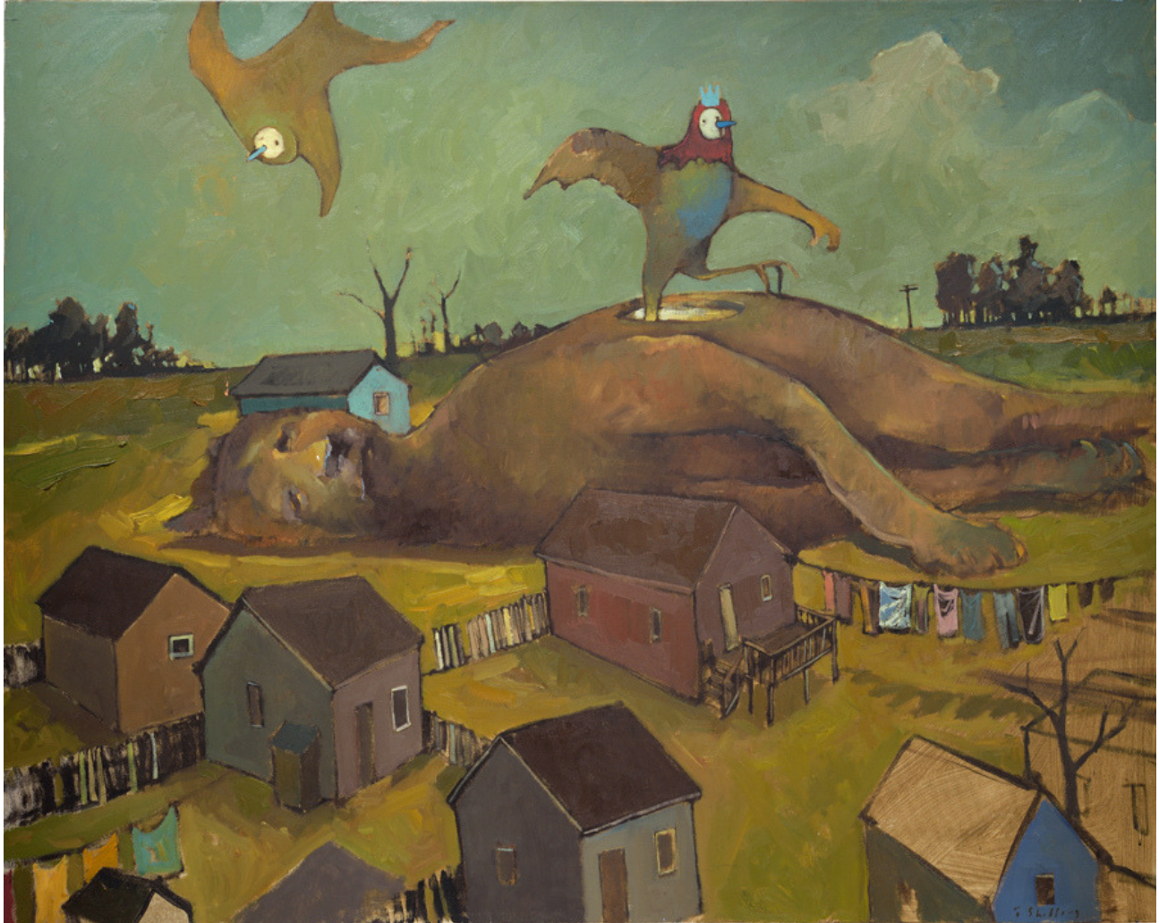
Travis Shilling "Spirit #1" 2012 oil on canvas 40 x 50