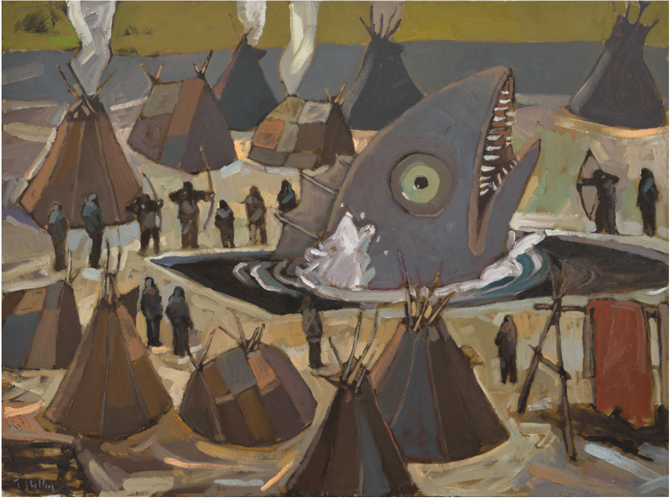
Travis Shilling "The Village Dream " 2017 oil on canvas 30 x 40