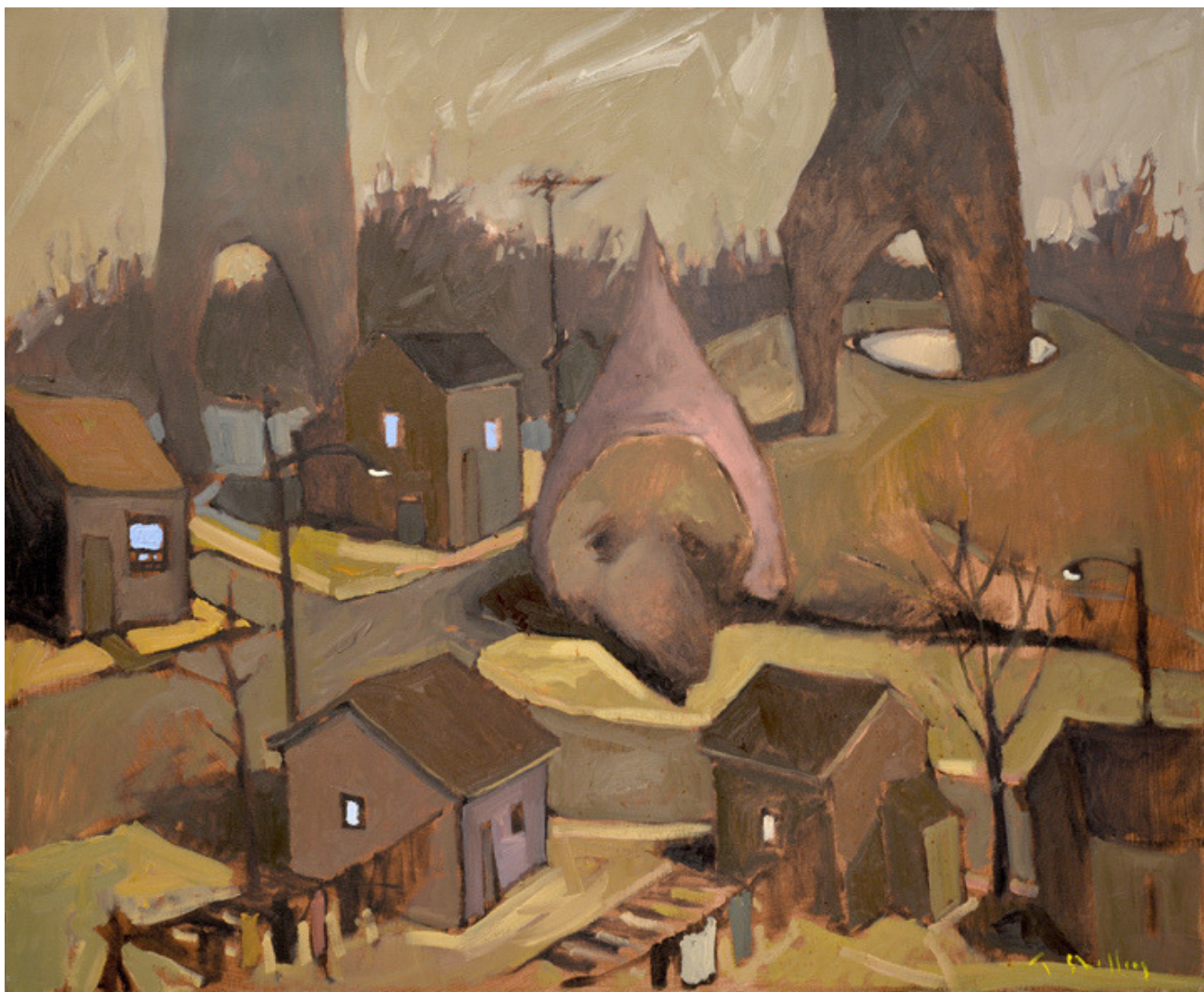
Travis Shilling "Spirit #2" 2012 oil on canvas 30 x 36