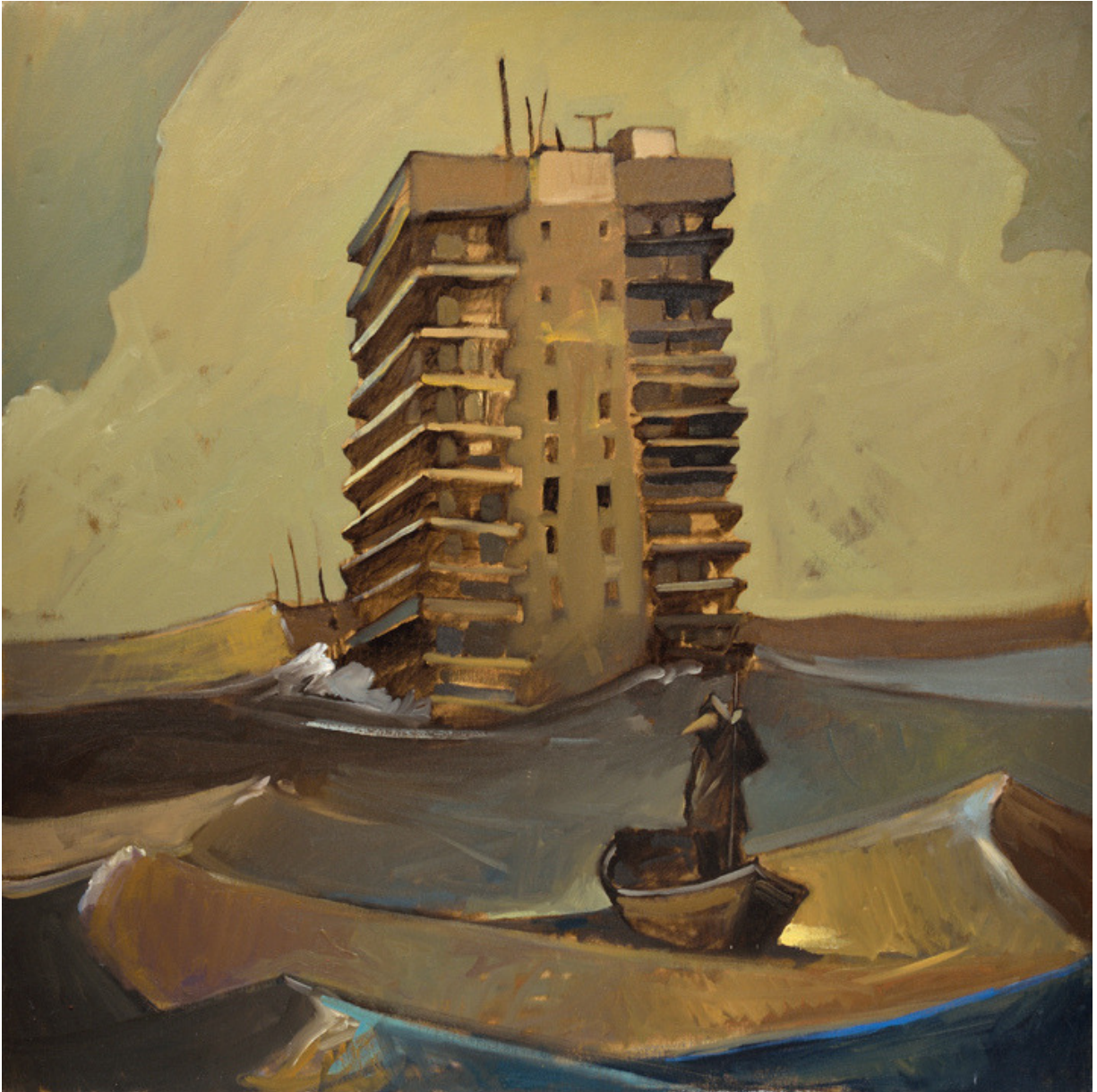
Travis Shilling "Apartment Building" 2013 oil on canvas 40 x 40