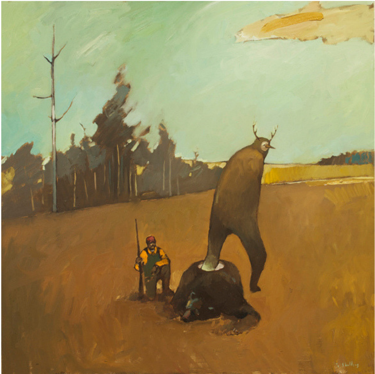
Travis Shilling "The Bear" 2012 oil on canvas 36 x 36