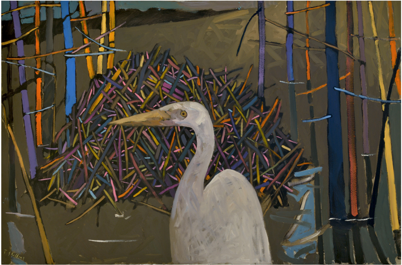
Travis Shilling "The Beaver Launch" 2017 oil on canvas 40 x 60