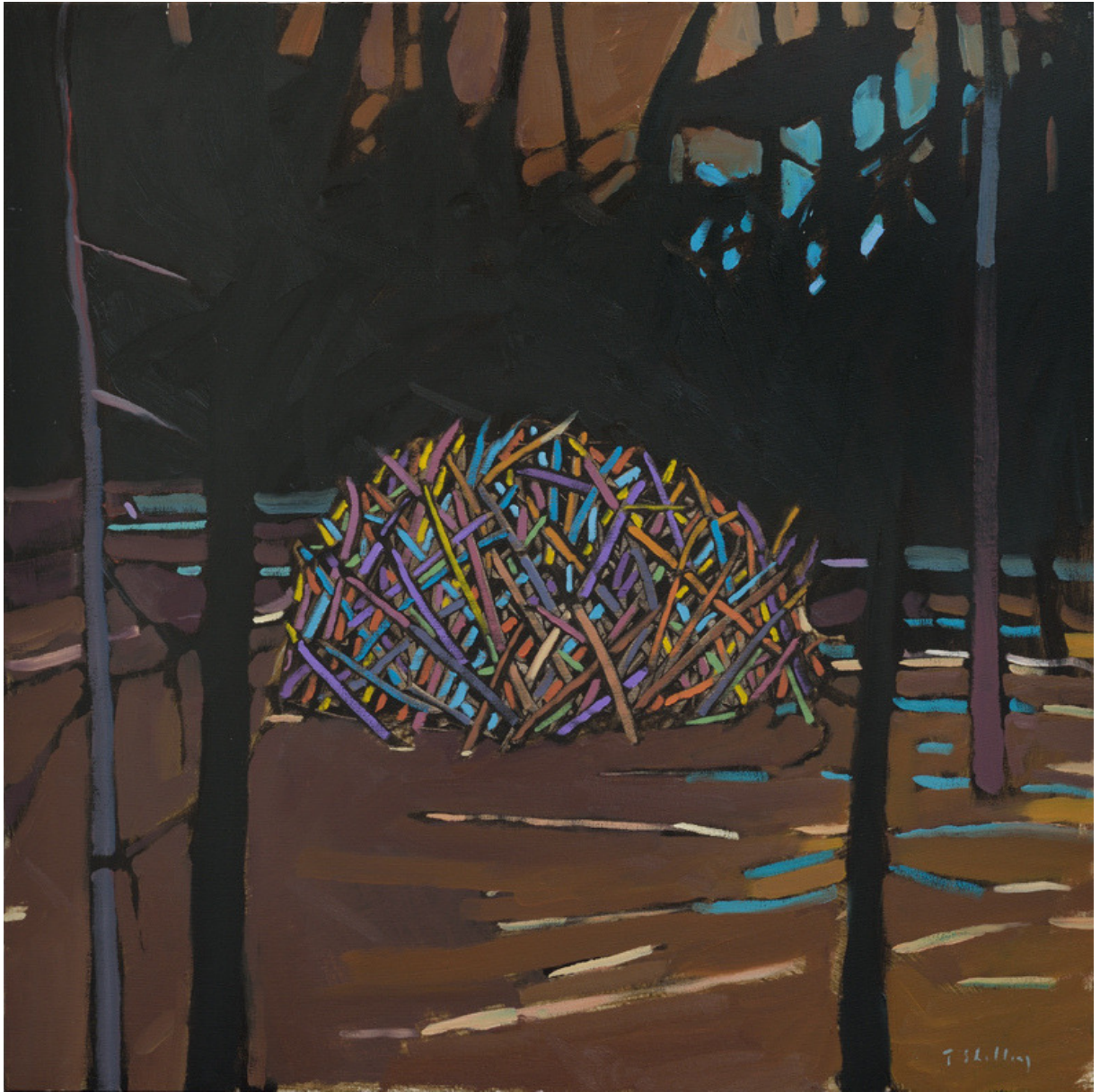
Travis Shilling "Beaver House" 2017 oil on canvas 30 x 30