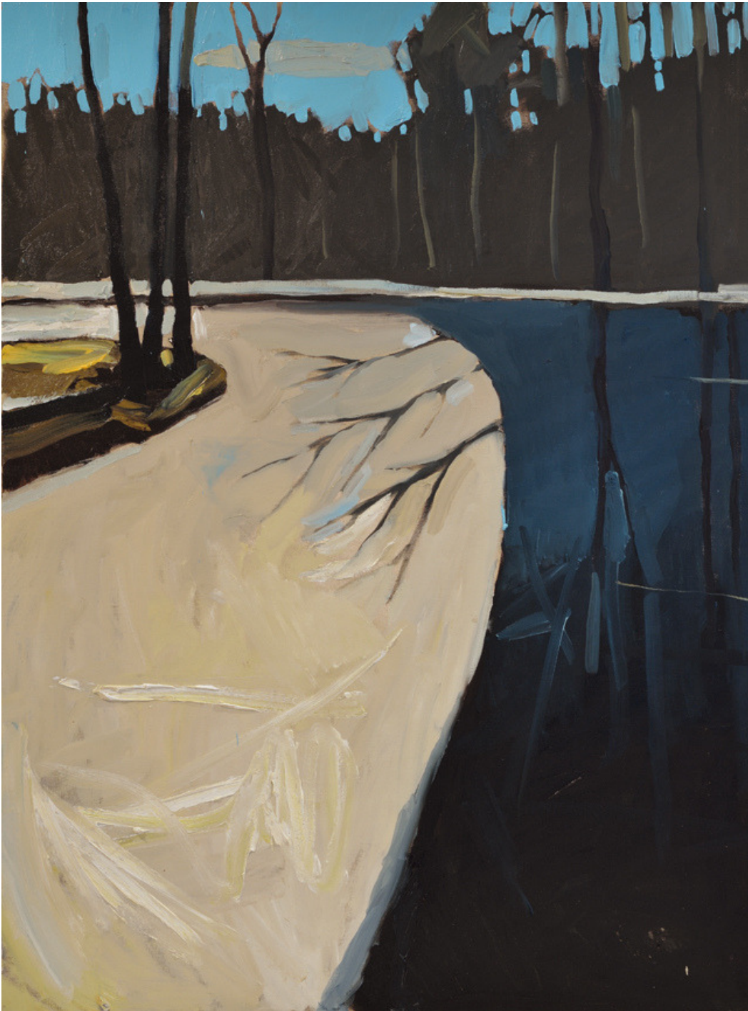
Travis Shilling "Landscape#1" 2016 oil on canvas 48 x 36